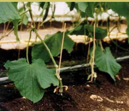
Compost provides organic matter and stimulates soil life

By increasing or maintaining the levels of organic matter in the soil, soil organisms are stimulated, and this helps with resistance to infections in general. Higher biological activity does not, however, automatically mean that the resistance to infections is good; specific antagonistic