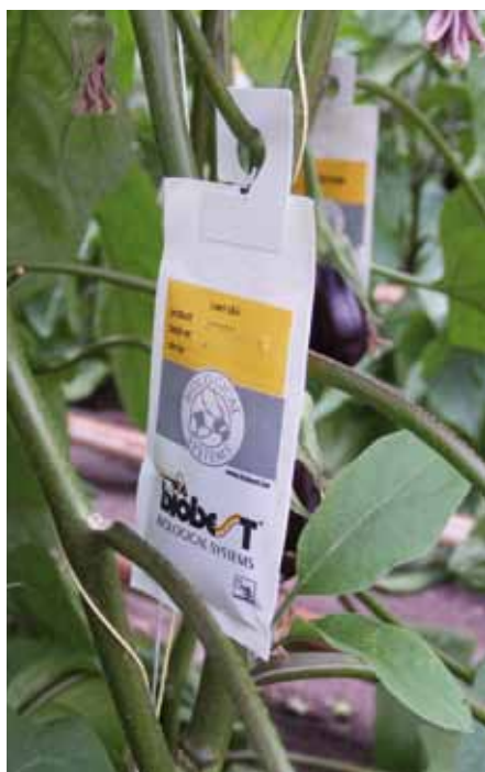
Predatory mite Amblyseius swirskii introduced to fight thrips disturbs biological control of aphids

Wageningen UR Greenhouse Horticulture has researched a number of aspects that