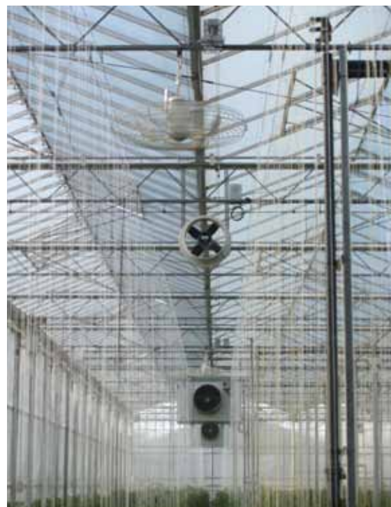
External air is warmed up, ensuring low relative humidity and drier crops

The Dutch interpretation of the EU rules is that organic cultivation under glass should take place in the soil. The Dutch certification organisation Skal does not certify cultivation in natural substrates. The demand to recognize substrate cultivation as organic is nevertheless increasing and has led to intensive discussions with the government and with various organisations at home and abroad. Many years of intensive cultivation of greenhouse vegetables in the same soil causes production to drop off and soil infections and infestations to increase. An increasing occurrence of