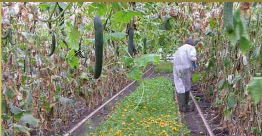
Rotation with Tagetes suppresses the nematode population

microorganisms are necessary for this. Several fungi can suppress the development of plant pathogenic fungi such as Fusarium , Botrytis and Pythium . The best known of these suppressors, Trichoderma , is now available commercially. Several compost companies routinely add Trichoderma to their compost, and plant cultivators introduce this fungus at the seedling stage if requested.