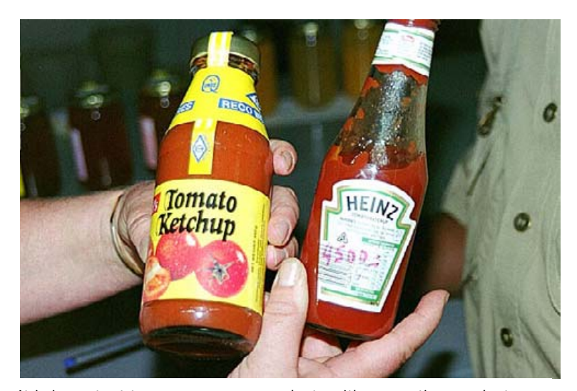
It is important to compare your products with competing products on the market.

The EPOPA approach of developing organic exports is based on established exporters. Before the project, they already have conducted conventional exports. After the project, they act as supply-chain managers, and they also hold the organic certificate. This approach has the advantage of making use of an existing export structure, reducing the time and effort needed to reach the market.