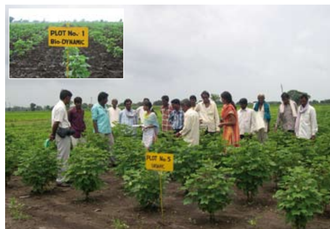
Farmers are highly interested in the trial. About 15 farmers' groups visited the field in the first cotton season. Insert: the cotton crop one month after sowing.