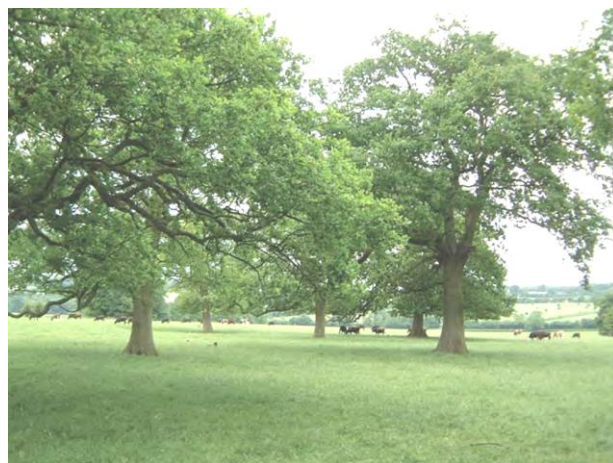
Figure 3 Wood pasture in Hampshire

Options for the maintenance or restoration of wood pasture and parkland (HC12 and 13) that support a number of ancient trees or parkland features aim to protect the wildlife, historic and landscape character. These sites may be currently under arable cultivation, ungrazed or planted with conifers or other inappropriate trees. Management includes protecting trees from livestock damage, grazing, no fertiliser applications, no cultivations and no re-seeding.