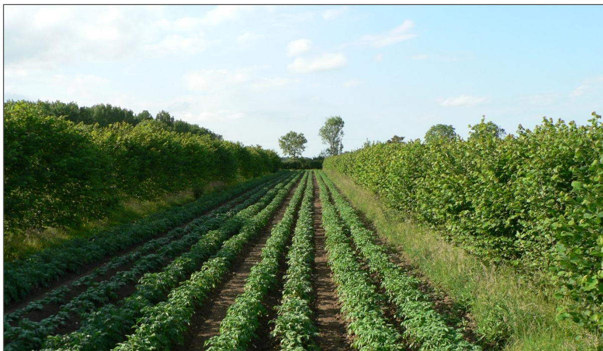
Figure 1. Hazel coppice for bioenergy production is planted in rows between alleys of arable and vegetable crops managed on an organic rotation in a silvoarable system at Wakelyns Agroforestry, Suffolk.