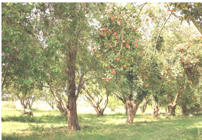
Figure 4 Traditional orchard (taken from Natural England 2010c)

These options provide support for traditional orchards characterised by widely spaced or half standard fruit trees of old varieties planted at low densities (less than 150 trees/ha) in permanent grassland. These orchards include apple (for fruit or cider), pear (for fruit or perry), cherry, plum, damson or cobnut plantations. Existing orchards over 30 years old are eligible for maintenance or restoration options, while remnant or recently planted orchards are supported by an orchard