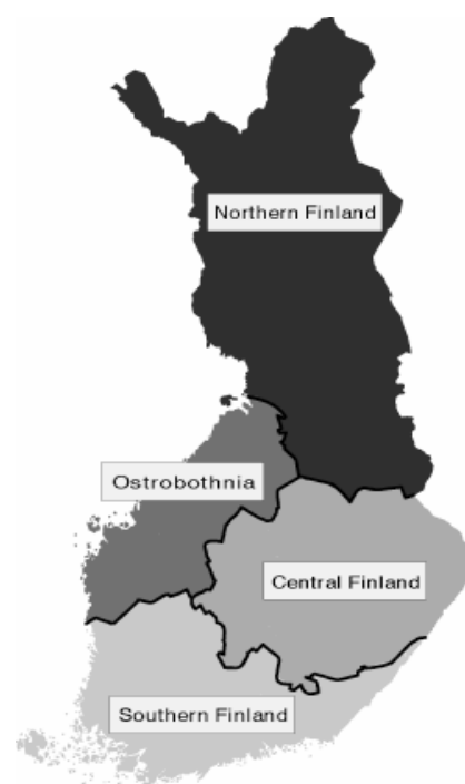
Fig. 1. Main regions in the DREMFA model.

Because agricultural support varies regionally in Finland, it is logical to examine also the effects of policy reforms in differing geographical areas. The sector model includes four main regions, northern Finland, Ostrobothnia, central Finland, and southern Finland (Fig. 1). According to Uusitalo (2003), most of the crop production in Finland is located in southern and south-western Finland and in Ostrobothnia. Dairy farming is regionally quite evenly distributed, but a dominant line of production in central and northern Finland. Most of the piglet and pork farms are located in southern and western Finland. The location of livestock production is reflected in the regional distribution of land use. The share of grassland in the cultivated area is large outside southern Finland.