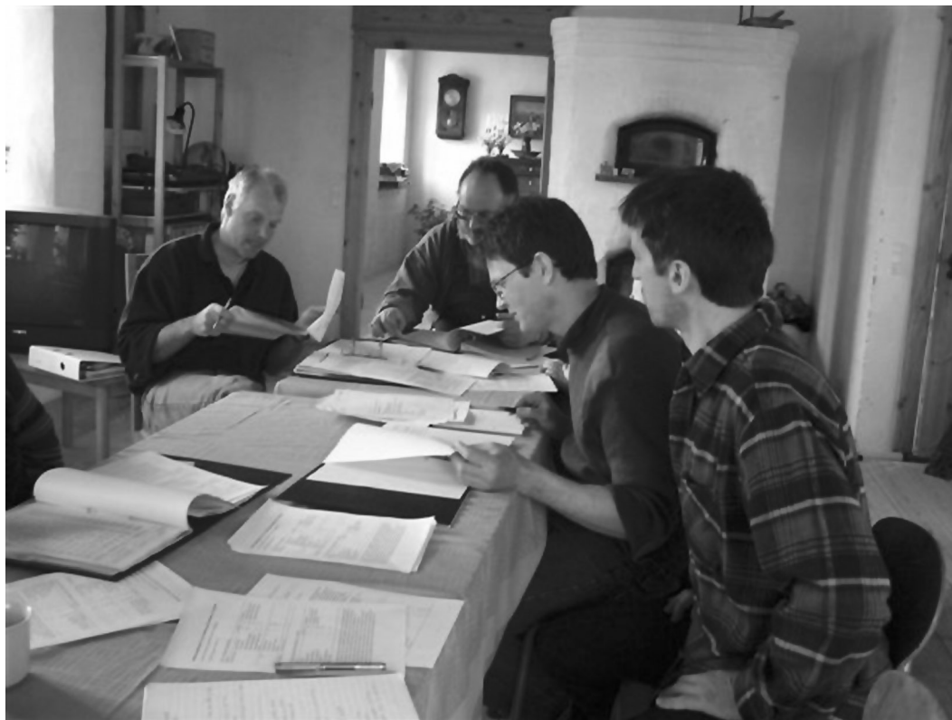
Figure 1. In the stable schools in Denmark, the farmers start with a farm walk, where the group gets an impression of the farm. After this, the farmers sit down and examine the results of the farm in terms of, for example, production, health and disease patterns, feeding plans, and calving patterns and findings in clinical examinations of the animals in the herd.