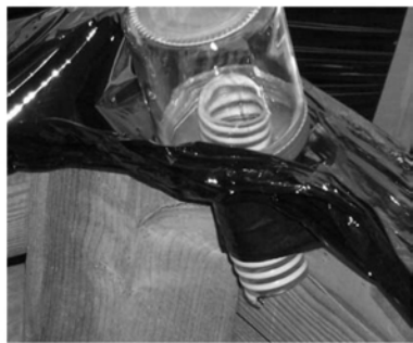
Figure 1: Electors for assessment of overwintering CM in the field trials and in the boxes

For the assessment, at the stem of each tree shortly before the beginning of CM flight, an elector with dark fleece material and rubber foam was applied (figure 1). At the top of this elector a glued honey glass was installed to capture the adult moths flying against the light. It seemed, that the hatching was remarkably retarded by the elector. Furthermore, not all moths went into the glass. Thus, when the elector was removed, the stem was examined carefully for remainings of hatched pupae. It could happen, that adult moth were found and no remainings of pupae and also pupae and no adult moth.