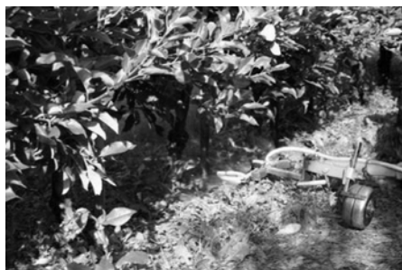
Figure 2: herbicide sprayer with special arrangement for treatment of stems

If only the stems were treated (1 m tree height), the application was carried out with a herbicide sprayers with flatfan nozzles and a special construction (figure 2). If the whole tree was treated, a normal sprayer with flatfan nozzles was used.