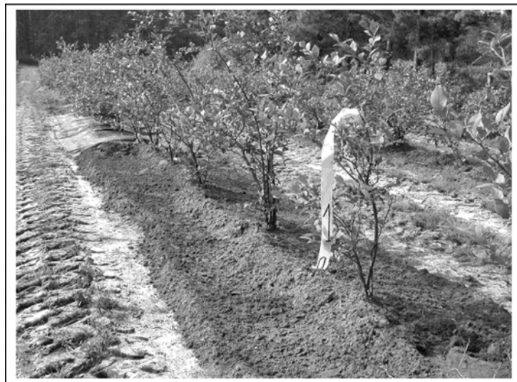
Figure 1: Arrangement of blueberry bushes on the experimental plot.