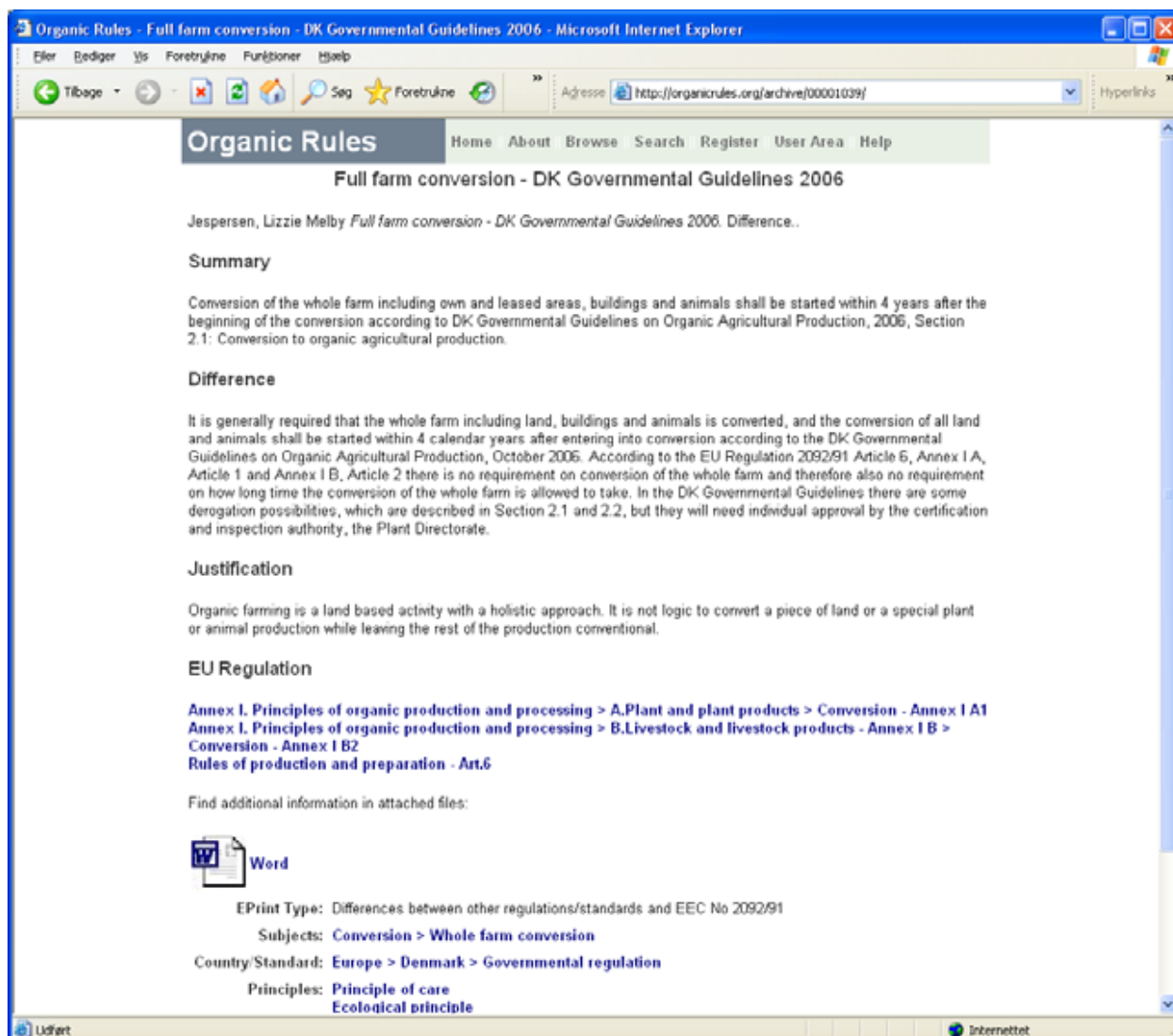
Figure 2-4. View of the web page when the Eprint link: “Jespersen, Lizzie Melby Full farm conversion - DK Governmental Guidelines 2006. Difference” is selected.

This is the Summary page of the E-print presenting a summary, a description of the difference and the justification for the difference. Additional information can be found in an attached file. The attached file covers the original text about full farm conversion in the Danish Governmental Guidelines, 2006