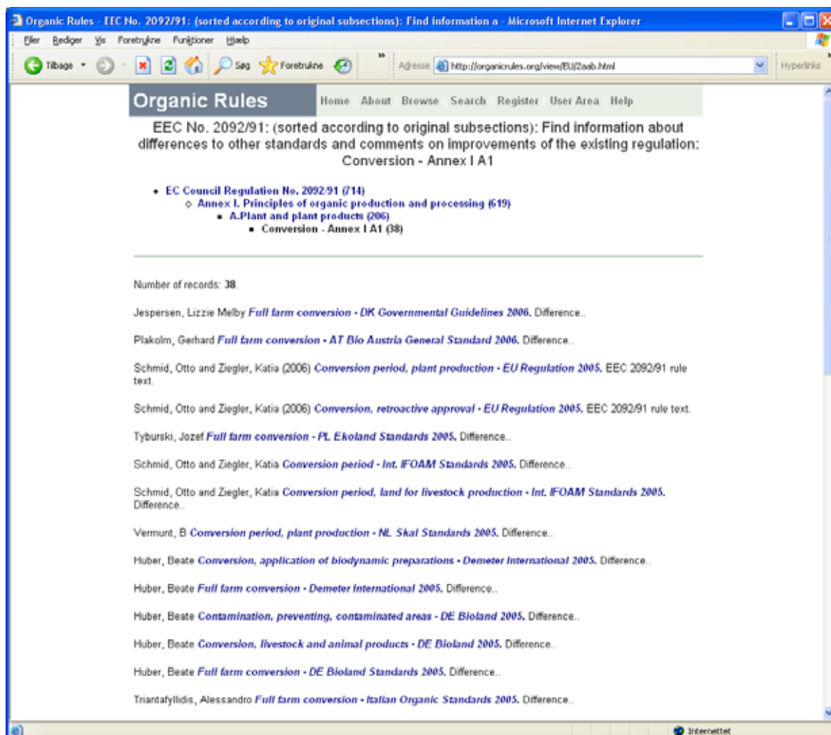
Figure 2-3: View of the web page when “Conversion – Annex 1 A1” from the EU Regulation Browse tree (see Figure 2) is selected.

In the link for Eprint types = differences, the author, the subject, the Standard name and the year of publication of the standard are found. In the link for the EEC 2092/91 rule texts the name of the persons that uploaded the section and the EEC Regulation 2092/91 article or annex short-title are found.