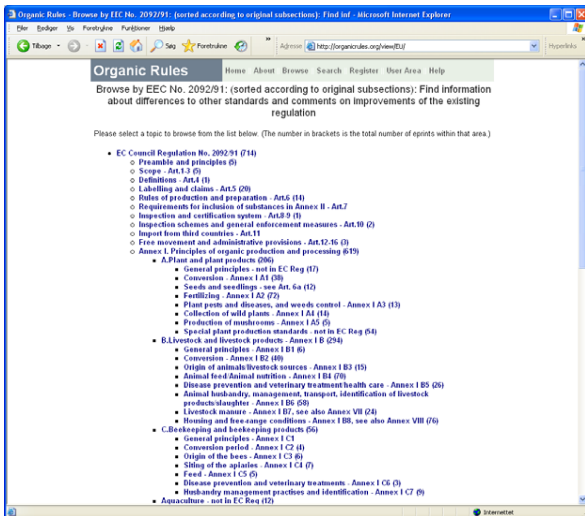
Figure 2-2: View of the web page when: “Browse the database by: “Differences between other standards and EEC 2092/91” is selected.

The browse tree includes some sections that are not part of the current Regulation (EEC) 2092/91 but are likely to occur in several standards. Those sections are marked “– not in EEC Reg.” (e.g. Special plant production standards - not in EC Reg (54)). The number in brackets is the total number of Eprints within that area. For each link a new web page opens presenting a list of titles of Eprints for: EEC 2092/91 rule text, differences between another standard and that specific section of the regulation (EEC) 2092/91 or, an Eprint with comments on improvements of the existing regulation (see figure 2.3)