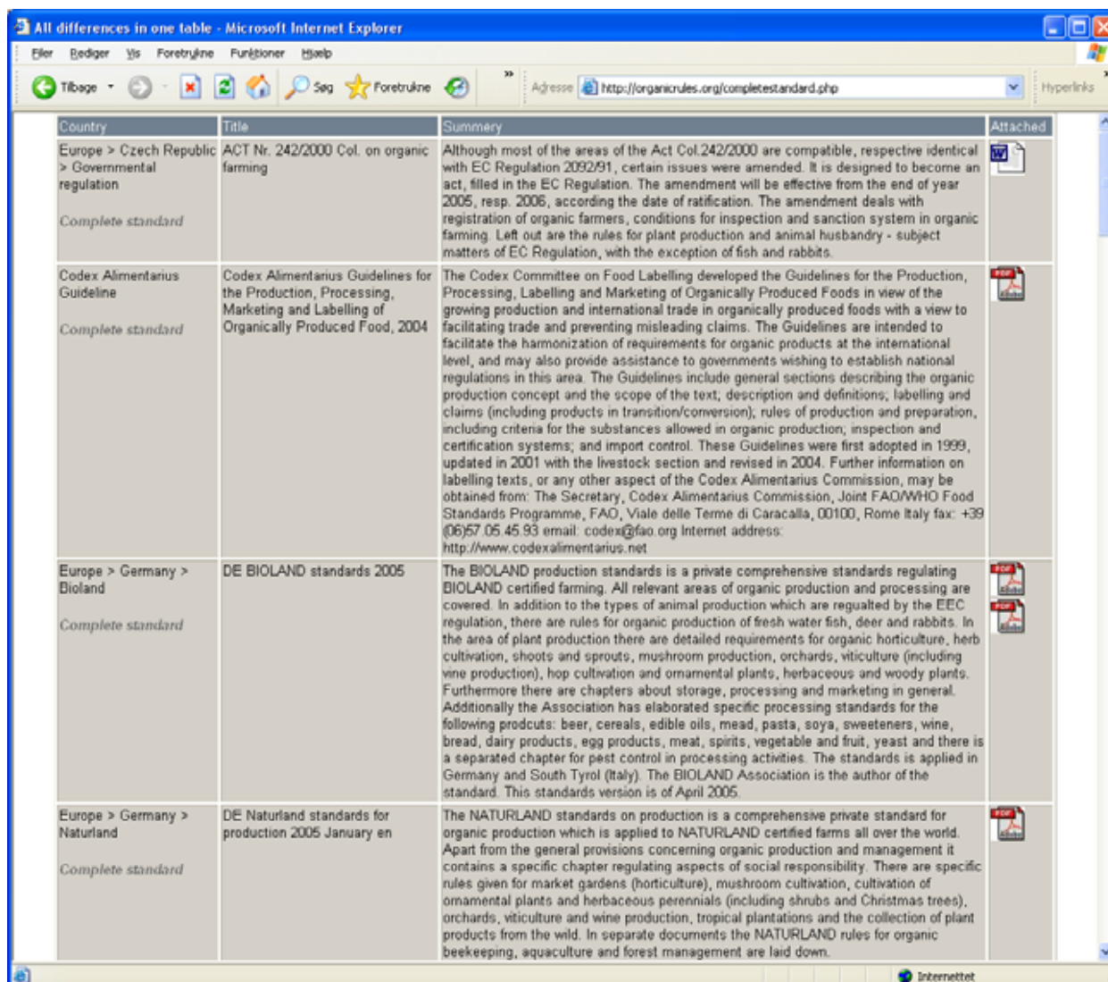
Figure 2-6. The view of the web page when “All complete standards in one table“ is selected (see Figure 2.1).

A short description of all the uploaded standards held by the database can be found here, and the full text in an attached file can be opened or downloaded.