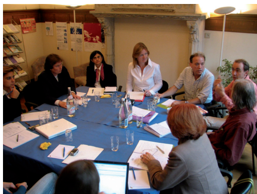
Fig. 1: IFOAM-EU Group discussion of European Organic Action Plan

Two series of national workshops in 8 countries were conducted with stakeholders and one with the IFOAM-EU Group. Experiences and conclusions from the ORGAP Project regarding stakeholder involvement are described in ORGAPET, the ORGAP evaluation toolbox (Lampkin et al., 2008) as well as in a resource manual for the organic sector on development, implementation and evaluation of organic action plans (Schmid et al. 2008). See project website: www.orgap.org