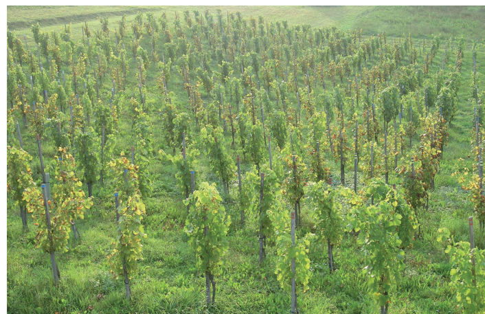
Figure 2. Overview of the screening vineyard on 19 th August 2005.