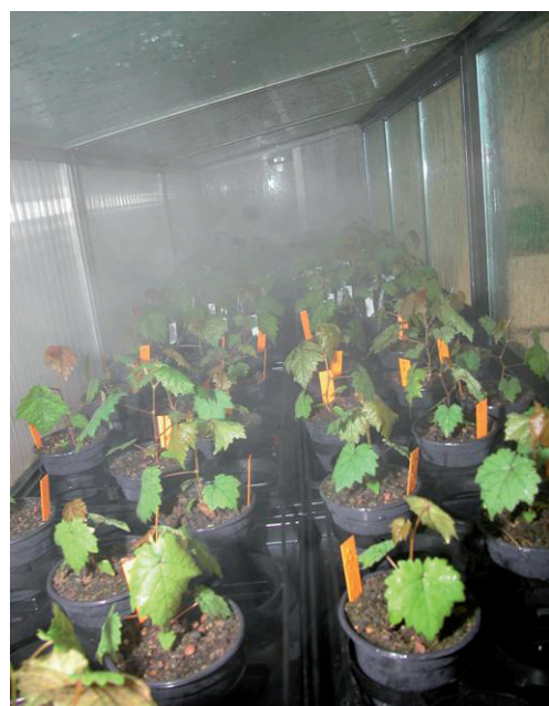
Figure 1. Incubation of grapevine seedlings for efficacy testing of novel plant protection products (indoor screening).

The field experiments were carried out in a screening vineyard in a randomized block design (Fig. 2). The test products and reference treatments were deployed weekly. The plants were treated with an air assisted knapsack sprayer until near run-off. During the growing season, visual disease scoring was carried out several times by recording disease incidence and disease severity. The experiments were carried out following the relevant EPPO guidelines.