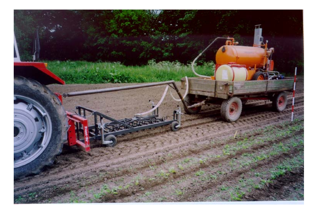
Figure 3. A prototype band-steamer with a 200kW steam generator. Thirteen steaming tines are placed along a 7-cm wide line on the towed frame that is mounted to the 3-point linkage of the tractor.

different: Capsella bursa-pastoris 70°C; Chenopodium album 65°C; Tripleurospermum inodorum , Polygonum spp. and grass weeds 60°C; ryegrass and rape 75°C. Chilling generally lowered seedling emergence of all the weed and crop species in the untreated trays and in those where the maximum temperature did not exceed 40 °C, probably because chilling caused non-dormant seeds to become dormant. However, the opposite was true for Polygonum spp. in the soil collected in the autumn 2000, where chilling had broken dormancy of the majority of the seeds, and thus more seedlings emerged in the chilled fractions. The lethal effect of steaming on dormant Polygonum spp. seeds was, however, similar to that found for the non-dormant weed species.