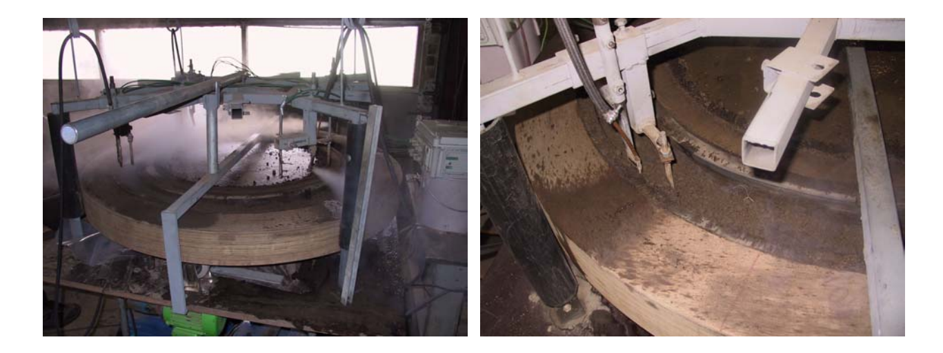
Figure 1. A circular groove for band-steaming in the laboratory

Two investigations were conducted in the laboratory, where soil steaming took place in a 7 x 8 cm circular groove made in a wooden wheel with insulation in the bottom and at the sides (Fig. 1). Soil was steamed by a timed flow of steam through rubber tubes, each connected to a tine with two 1.5 mm holes. Four steam generators with a total effect of 8 kW produced steam. A total of eight tines were placed so that the soil volume in the groove was steamed evenly. The soil temperature was continuously measured by eighth thermocouples placed evenly in the soil while steaming and in a short period after steaming had been stooped. The soil was collected from a sandy loam expected to contain many natural weed seeds of different species. Samples were collected in October 2000 for the first experiment and March 2001 for the second one. In the second experiment, seeds of oil seed rape ( Brassica napus ) and ryegrass ( Lolium perenne ) were added to the samples prior to steaming, half of the soil fractions were chilled at 5°C for 30 days in order to break seed dormancy. Both chilled and non-chilled soil fractions were germinated for 6 weeks in watered trays in the glass house, and weed seedling emergence was registered regularly on species level in the germination period. Each treatment was replicated three times.