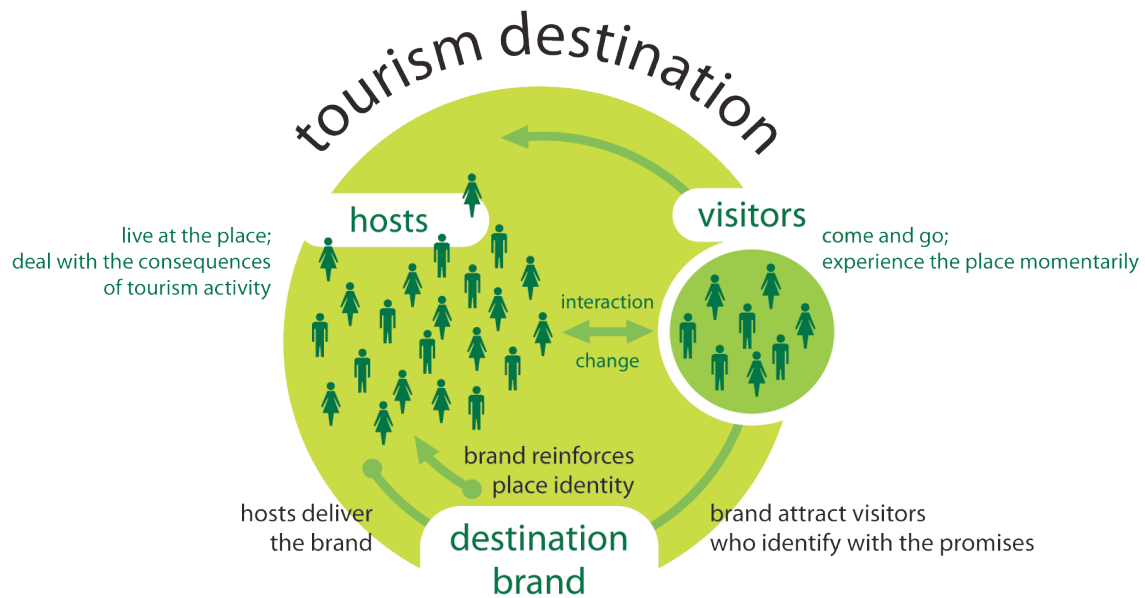
Figure 2 – The dynamics of destination branding. From (Taboada, et al., 2008).