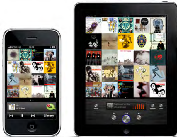
Fig. 1. Capital Music

During a three-year study, three software applications have been developed aiming to create and influence the experience of collocated people in urban public places through digital place-based mobile multimedia augmentations and anonymous mobile mediated interactions between collocated urban dwellers who congregate in the past, present, or future.