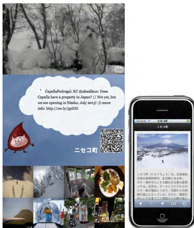
Fig. 2. Sapporo World Window

Capital Music (Seeburger et al., 2010) is a mobile application designed for iOS, enabling collocated people to listen to their music as usual but also sharing a patchwork of the coverart of the songs currently played in the vicinity. Users can anonymously exchange messages based on viewing other people's song choices. Figure 1 visualises the user interface of Capital Music.