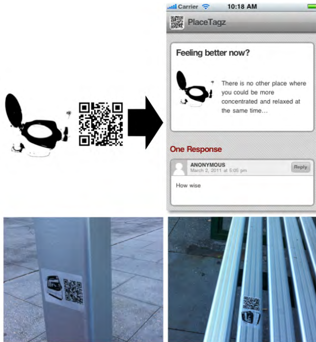
Fig. 3. PlaceTagz

All three projects add a digital layer to the physical urban environment, enabling collocated people to anonymously interact with each other and the specific information they share. These projects are in response to the question ‘how can ICT be applied to create and influence the UX in public urban places?’. The study requires a methodology that assesses how the UX is influenced by these applications and their specific interaction qualities.