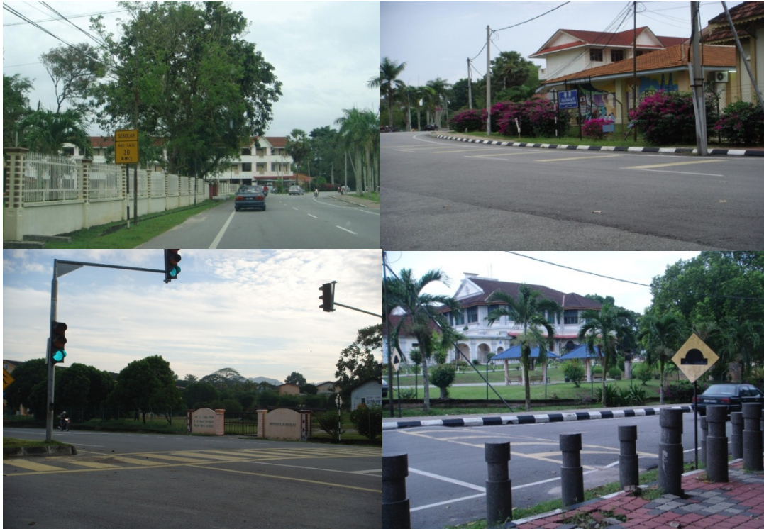
Figure 2. Typical countermeasures in school zones in Malaysia. Clockwise - transverse bar, speed hump, traffic light with zebra crossing and school zones and 30km/hr speed limit sign.