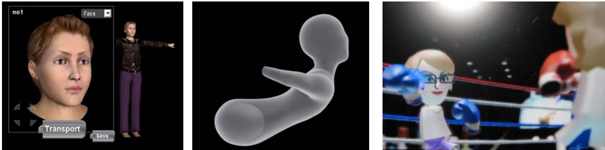
Figure 1: Evolver, templated 3D avatar, 2009

the context and the purpose of the interaction or communication. Moreover, we might project ourselves differently next week or next year. After all, the formation of identity is a lived and emergent process. It is responsive to shifting relationships and understandings of the world. The projection of identity, as well as identification with an avatar, must therefore be framed at the outset as contextual, fluid, and socially continuous. We will identify with an avatar only to the extent that it provides a good fit – in the here and now and for the purpose at hand.