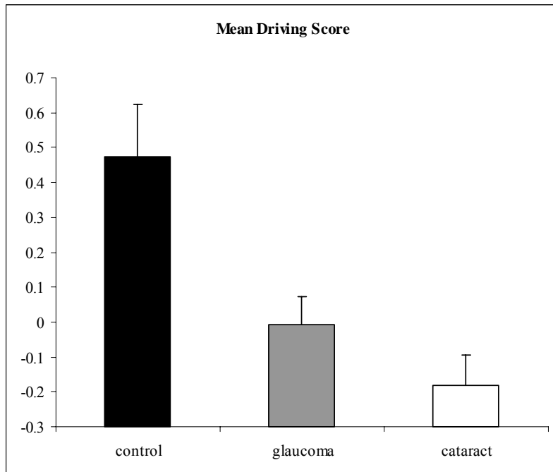
Figure 1: Mean Driving Score.