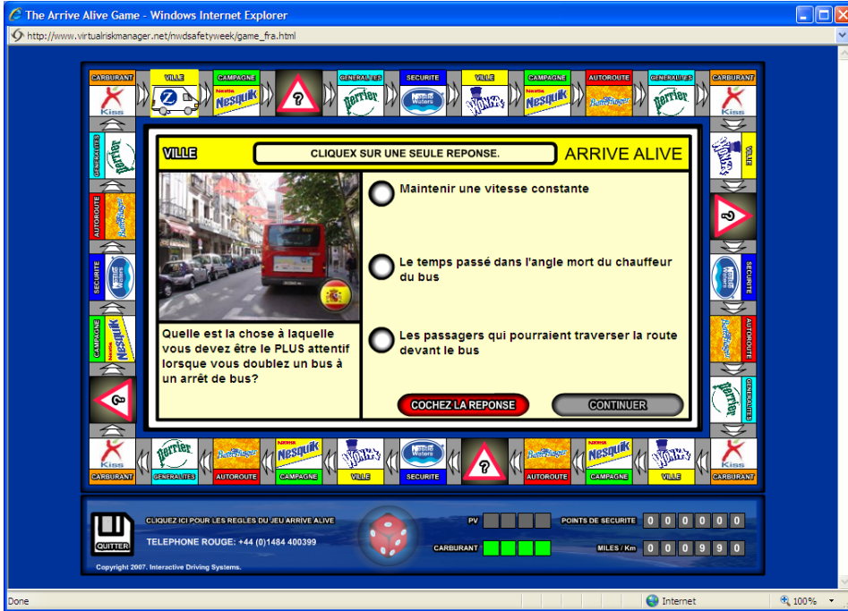
Figure 4 - Nestlé Waters Direct Road Safety Game

On all its KPIs, Nestlé Waters Direct has clearly made a significant difference to safety performance and costs.