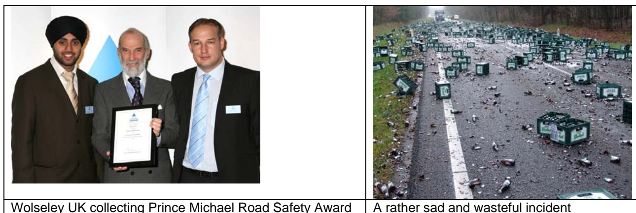
Figure 1 – Positive (safety award) and negative (lost product) fleet safety outcomes