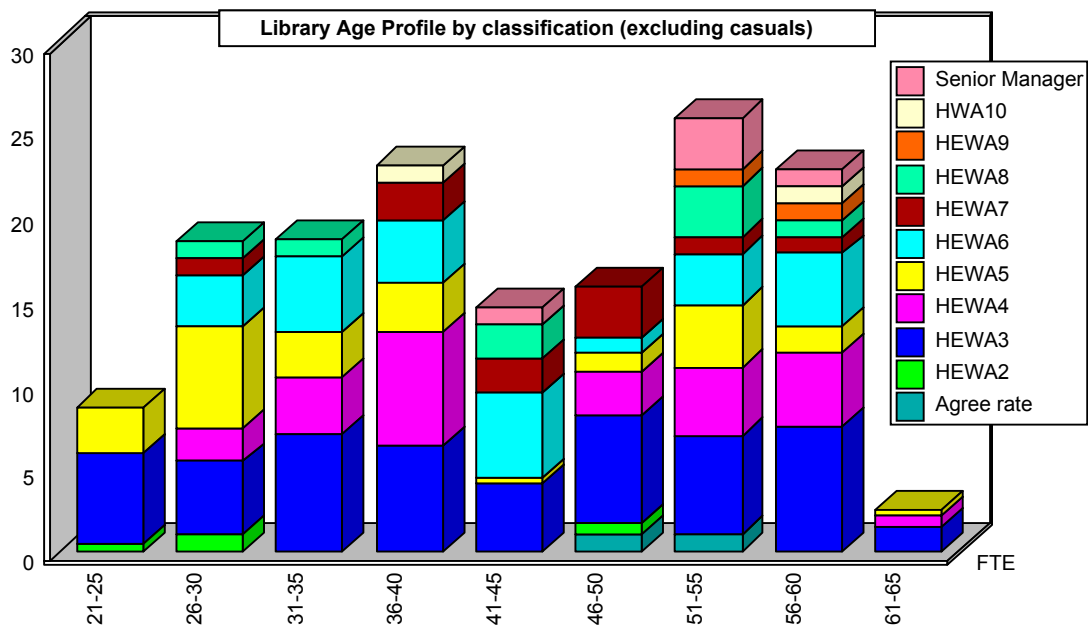
Fig. 2 Queensland University of Technology Library Age Profile

This age profile is mirrored in other Australian libraries. Curtin University of Technology reports that 52% of its staff are over 45, with 15 % being over 55 [personal email]. At the University of Technology Sydney 49% of the staff are over 45, with 10% over 55 [personal email].