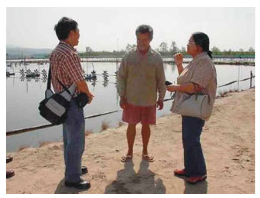
P. vannamei farm in Prey Noup District of Sihanouk Ville.

Penaeus vannamei is not indigenous species in the coasts of Cambodia. P. vannamei postlarvae were first imported to the country from Thailand in 2000 for trial stocking by a private shrimp farmer in Otres of Sihanouk Ville, and later from Taiwan of China in 2003. Currently, there are two shrimp farms (6 ha) in Sihanouk Ville stocking this white shrimp ( P. vannamei ).