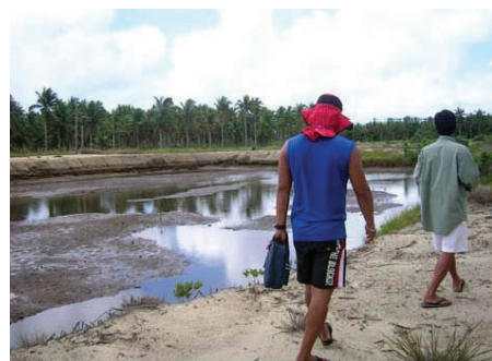
Left: Existing ponds near an airport in Aurora recommended for nursery development.

T he provinces of Mindoro Oriental and Aurora are now officially part of the Institutional capacity development for sustainable aquaculture (ICD-SA) program of AQD. This was after the completion of initial assessments and the laying-out of future plans in the respective project sites.