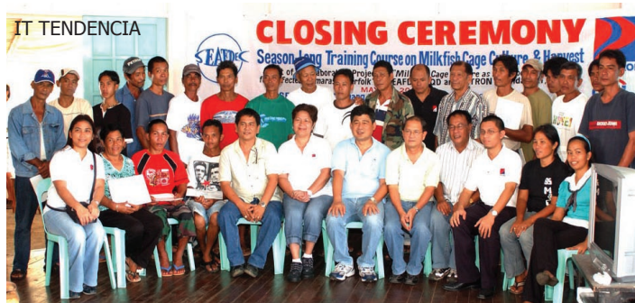
Guimaras fisherfolk-trainees gather with Petron and AQD staff for a group picture during the closing ceremony of the Season-long training course on milkfish cage culture

The participants come from two fisherfolk organizations whose livelihood was affected when an oil tanker sank off the coast of Guimaras last August 2006 spilling hundreds of thousands of liters of bunker fuel to the sea.