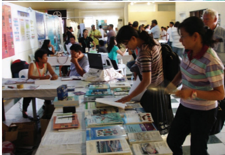
Top: The session hall of the 6th Philippine Shrimp Congress in Bacolod City. About 500 people participated in the event.