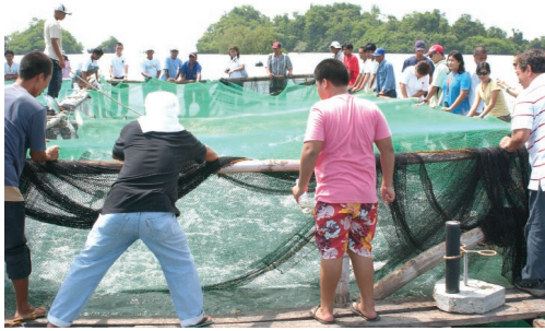
Top: Trainees posing in front of the milkfish cages. Above: Trainees, Petron representatives, and other guests observe a harvest.