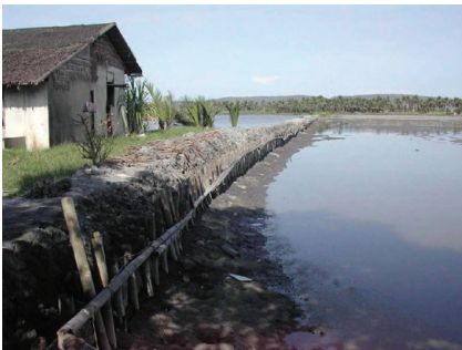
Above: One of the ponds owned by a SANAMSIM member in Mindoro Oriental where soil samples were taken.

AQD recommended an intensive training course on pond culture for the SANAMSIM operators and technicians, and the conduct of an on-site technological demonstration of aquaculture production systems.