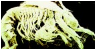
Figure 6-3. Penaeus monodon juveniles with necrosis in the abdominal muscles