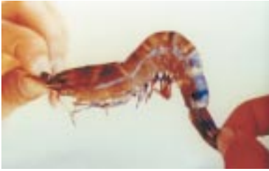
Figure 6-5. Tiger shrimp juvenile with body cramp

Bent/cramped tails or body cramp in shrimps is associated with handling of shrimp in warm, humid air much warmer than culture water, and mineral imbalance.