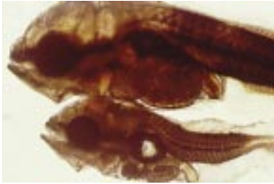
Figure 6-2. Seabass larva with Swimbladder stress syndrome compared with normal larva (top)

Swimbladder stress syndrome (SBSS) is associated with malfunction of the swimbladder and is also associated with a combination of handling, high ambient temperature, high ambient illumination, dense algal bloom that presumably cause oxygen depletion at night and supersaturation during the day.