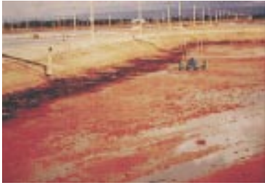
Figure 6-7. Pond with acidic soil

Acidosis is caused by low water and soil pH