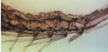
Figure 6-4. Penaeus monodon postlarva with "grainy" abdominal muscles

Muscle necrosis in shrimp is caused by temperature and salinity shock, low oxygen levels, overcrowding, rough handling and severe gill fouling.