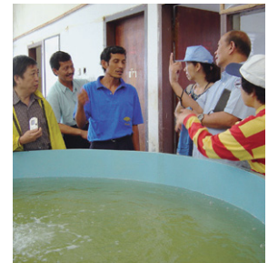
The Government Macrobrachium Hatchery (above) in Pelabuhan Ratu, West Java, Indonesia