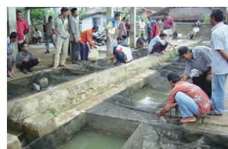
Freshwater fish trading (above) at the Fresh Fish Market in Sukabumi, West Java, Indonesia