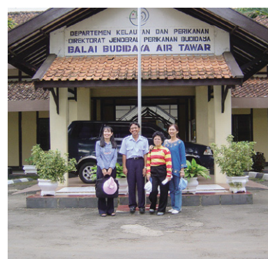
Venue of the November 2003 Round Table Discussion on Genetically Improved Strain of Macrobrachium : Freshwater Aquaculture Development Center, BBAT, Sukabumi, West Java, Indonesia