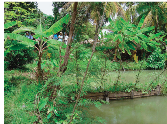
Freshwater prawn-fish polyculture pond (left) and prawn monoculture pond (right) in Indonesia