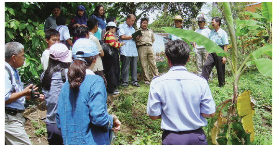
Freshwater prawn pond in Sukabumi, Indonesia (left) visited by Round Table Discussion Participants (right)

The Directorate General of Aquaculture through its facilities at the Research Institute for Freshwater Aquaculture has been conducting studies to improve the quality of the freshwater prawn, which was observed to be genetically deteriorating. A selective prawn breeding program has been implemented in order to improve production. This activity led to the development of an improved strain identified as the GI Macro or Genetically-Improved Macrobrachium . The culture of this improved prawn strain is now being adopted by some fish farmers in selected areas of the country.