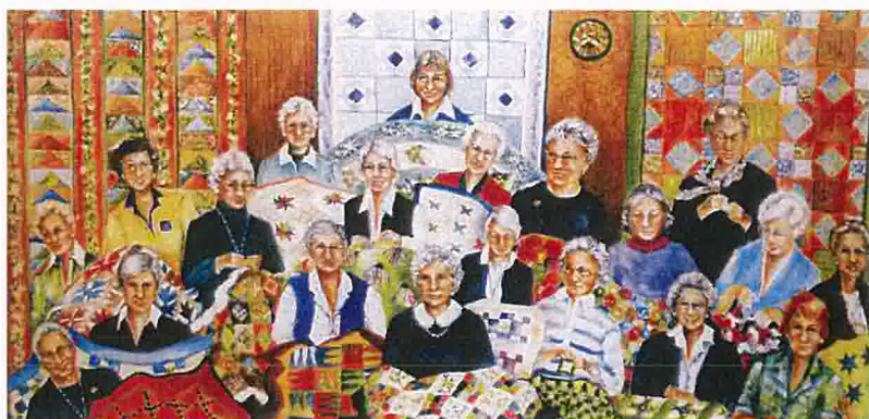
Figure 14: Judith Howard's painting of the Wednesday Quilters.