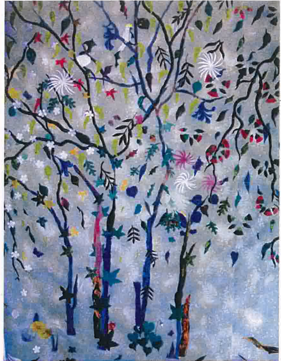
Figure 5: Jan Newell's quilt.