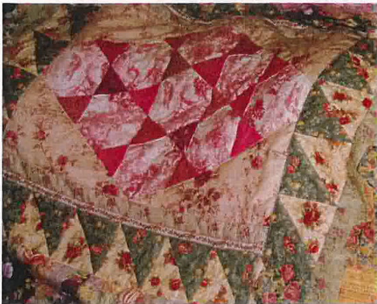
Figure 9: Detail from one of Vicki Cameron's quilts.