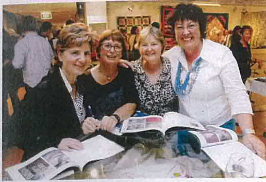
Figure 1: Participants meet for the first time at the 'it keeps me sane' exhibition