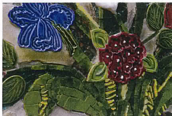
Figure 16: Detail from one of Leonie Scott's mosaics.

community networks and in these contexts they have other identities and roles. Their identities are fluid, multiple and shifting.