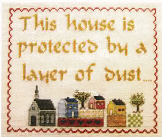
Figure 15: Marilyn Sullivan's cross-stitch.