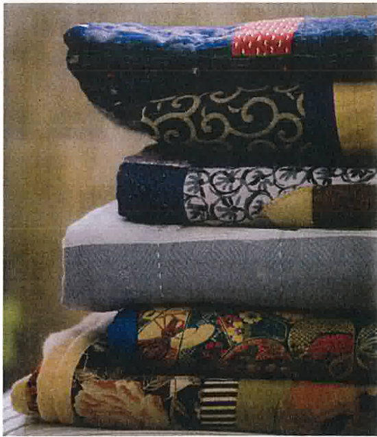
Figure 8: Jenny Chantry's quilts.