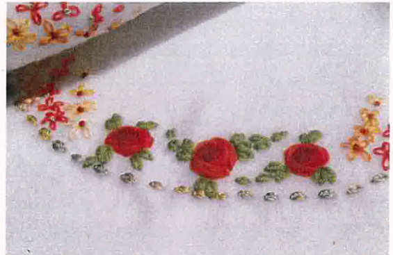
Figure 6: Detail from one of Angela Monitto's wool embroidered blankets.