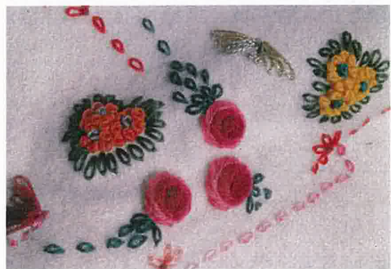
Figure 13: Detail from one of Angela Monitto's wool embroidered blankets.