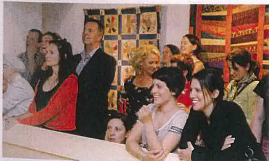
Figure 4: The opening of the 'it keeps me sane' exhibition.