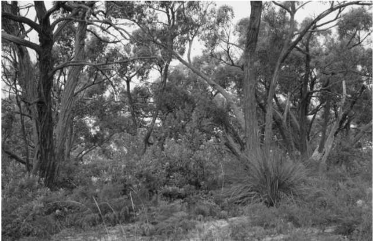
Figure 1: Dense Woodland (Component 1)