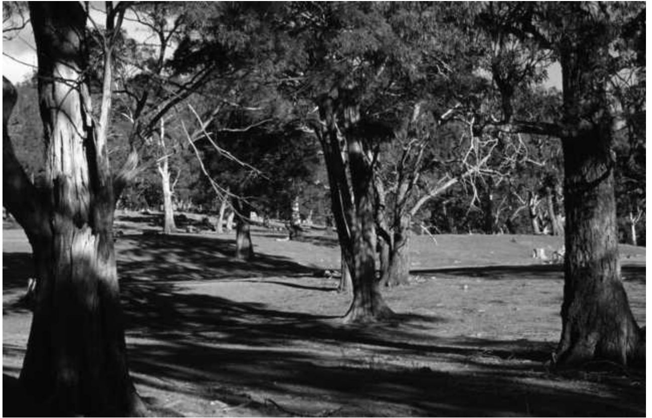
Figure 3: Grazed Woodland (Component 3)