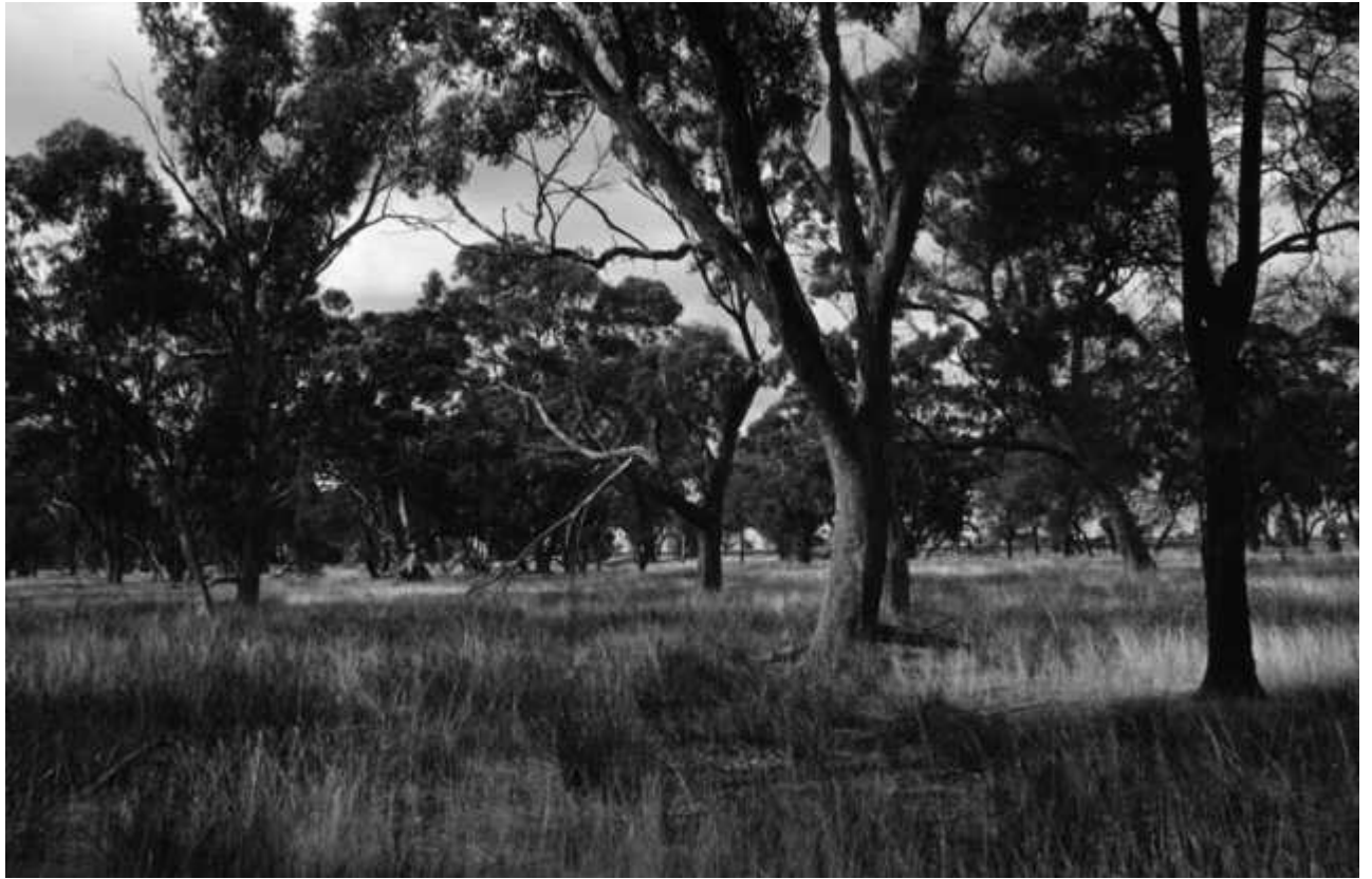
Figure 2: Grassy Woodland (Component 2)