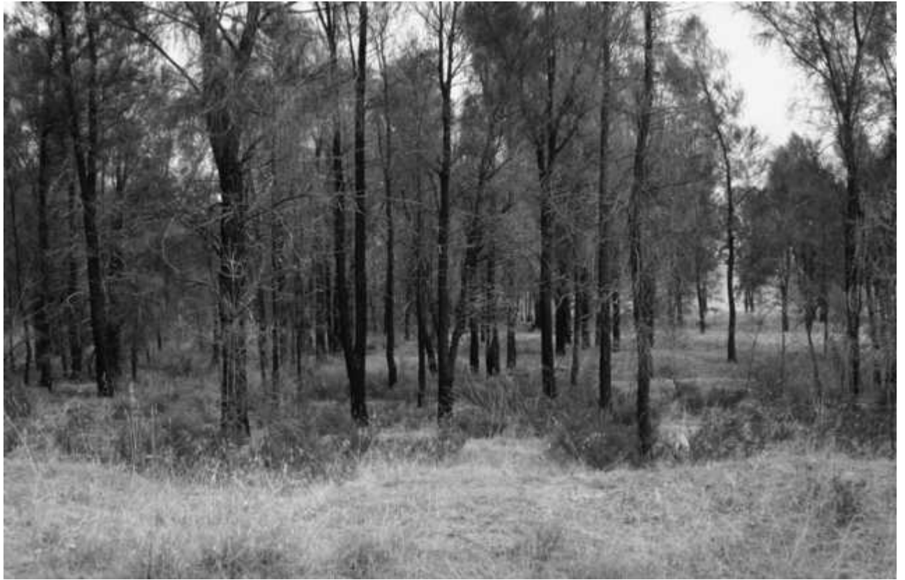
Figure 5: Bull-oak Woodland (Component 4), dense form