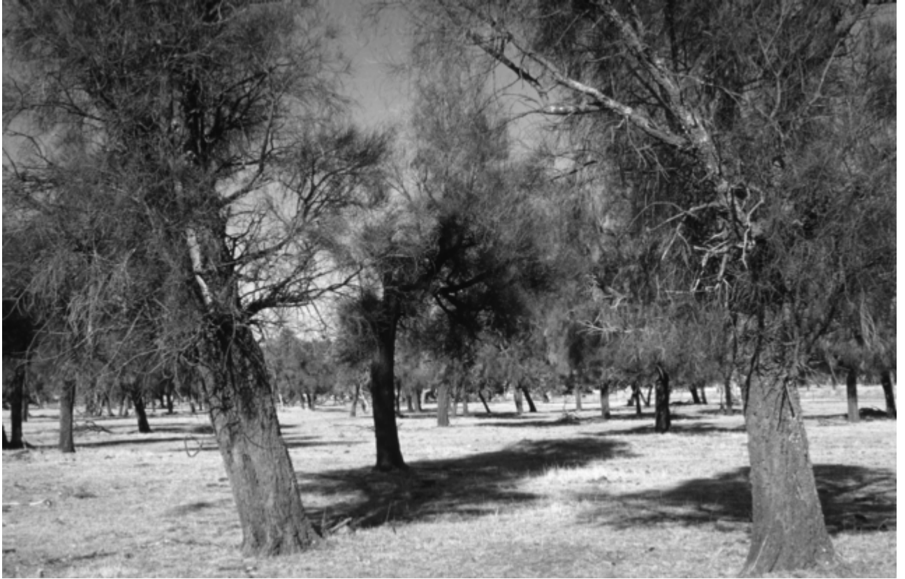
Figure 4: Bull-oak Woodland (Component 4), open form