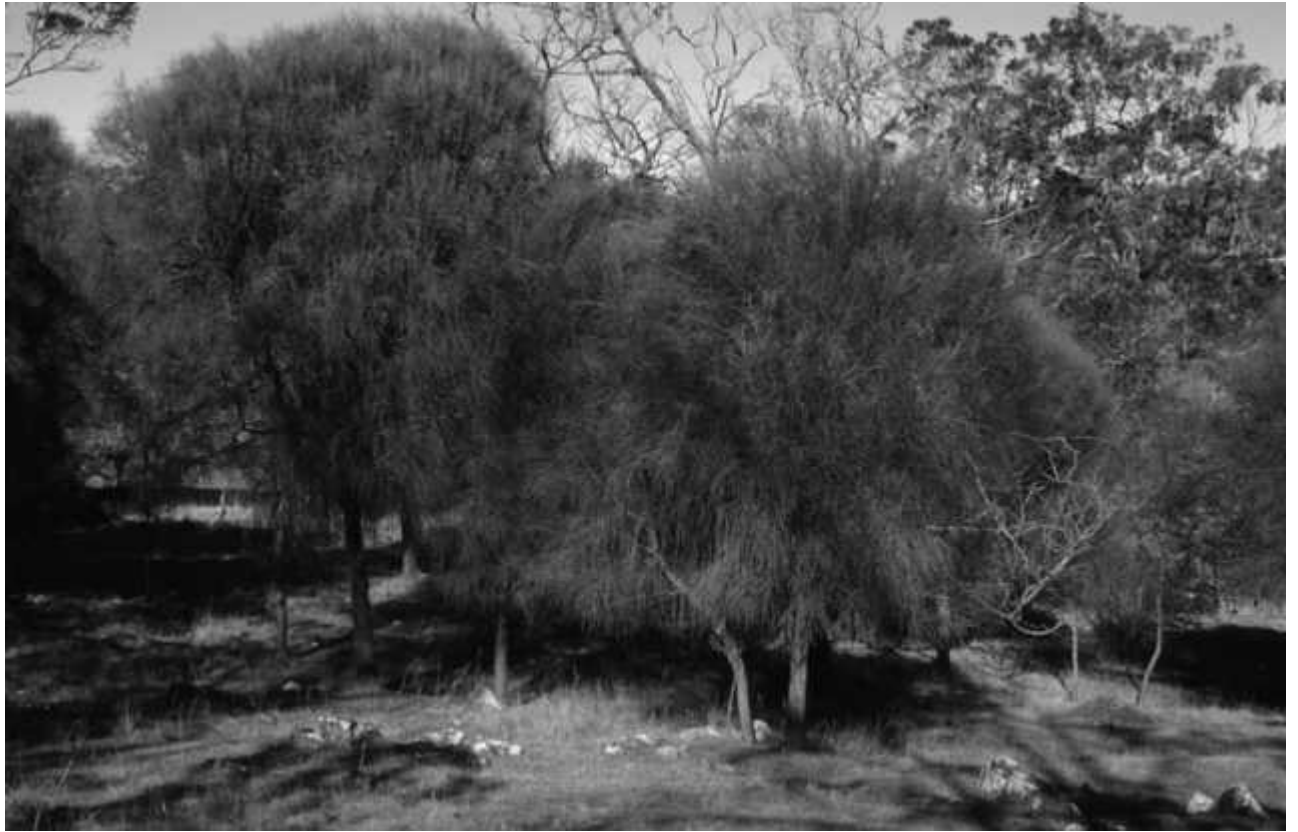
Figure 6: She-oak Woodland (Component 5)