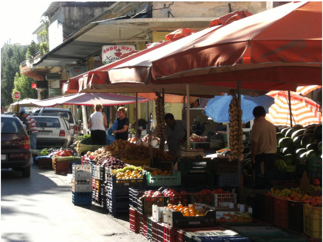
Picture.3. Monday market in central Trikala