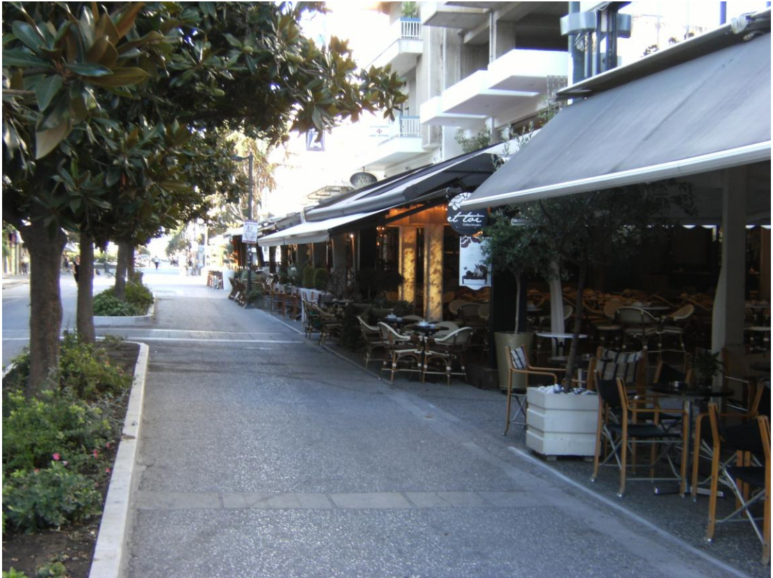
Picture.2. Setting up for another day's trade: early morning on Asklipiou