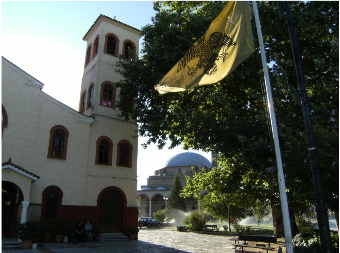
Picture.1. Greek Orthodox Church of Agios Konstantinos with the Ottoman Kursum Tzami in the background

The critical events in the history of Trikala since annexation from the Ottoman Empire are extensively covered in chapters three and four and facilitate the central arguments of this thesis. These events are discussed primarily in terms of social and economic impact on the local inhabitants, but also touch on issues of national and international importance. Therefore, for the present only a very brief outline of the history of the town will be presented.