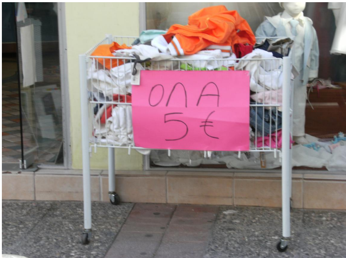
Pictures. 4 and 5. Examples of mid-summer sales on Asklipiou. The banner on the shop reads “For two more weeks even lower prices”. The sign on the bottom