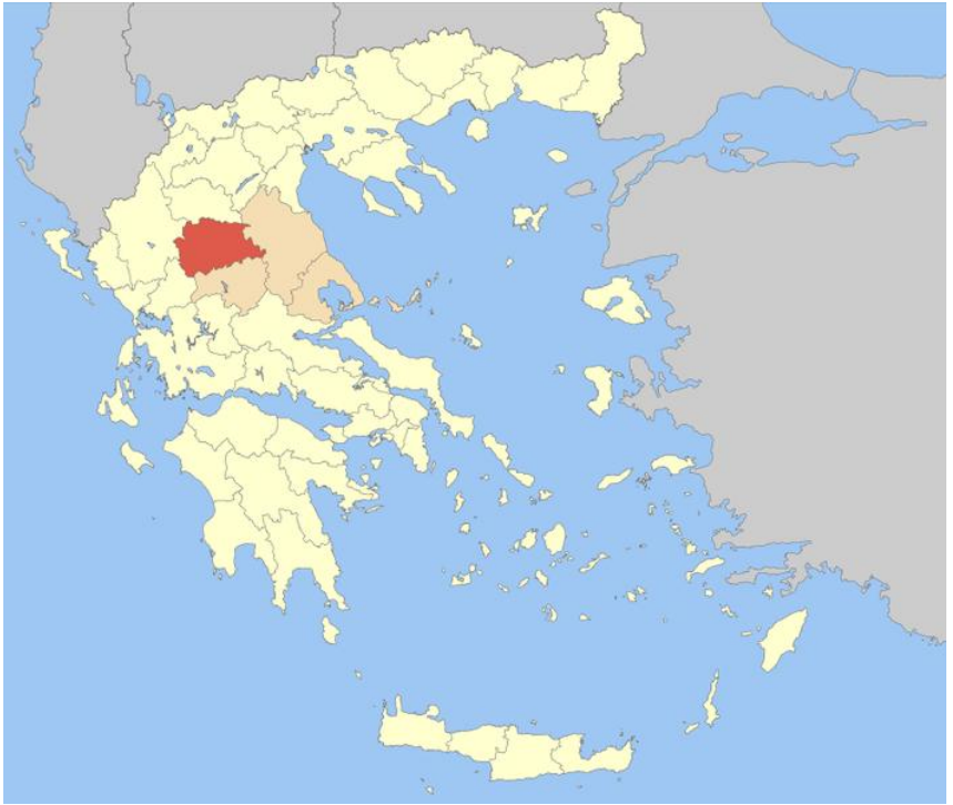
Map.1. The location of Thessaly periphery (light shading) and Trikala prefecture (dark shading) in Greece