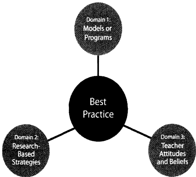
The Domains of Best Practice