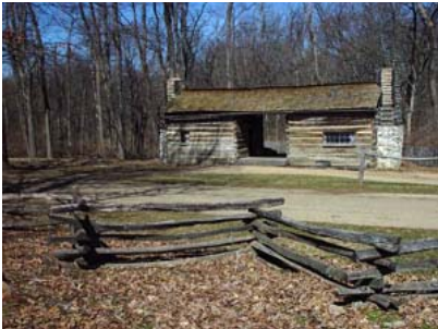
New Salem "dogtrot" cabin, similar to dogtrots in Texas that were popular at the time.