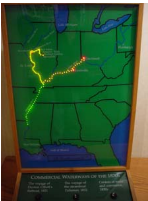
Frontier commercial centers at the time of Lincoln's youth were mostly on the Ohio River -- Pittsburgh, Cincinnati, Louisville -- and also on the Mississippi, comprising the "interstate highway system" of the early 19th century.