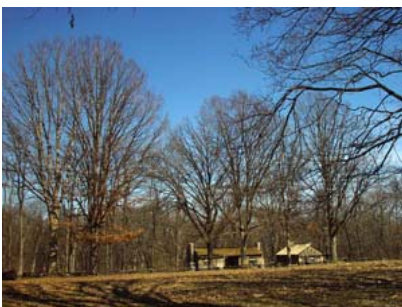
Scene from New Salem, which was a ghost town by the 1840s.