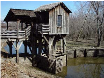
The water mill in New Salem