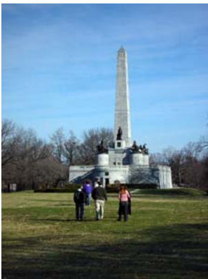
The next stop for the class was the Lincoln Tomb in Oak Ridge Cemetery, Springfield, IL. The official Illinois Historic Preservation Agency says:

Dedicated in 1874, the Lincoln Tomb is the final resting place of Abraham Lincoln, his wife Mary, and three of their four sons, Edward, William, and Thomas. The eldest son, Robert T. Lincoln, is buried in Arlington National Cemetery. Also on the site is the public receiving vault, constructed ca. 1860, the scene of funeral services for Abraham Lincoln on May 4, 1865.