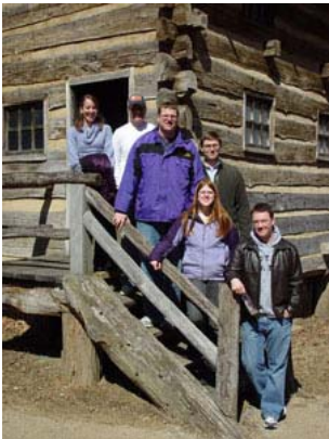
The class poses one last time in New Salem.