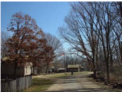
About Lincoln's New Salem State Historic Site, the Illinois Historic Preservation Agency observes:

The six years Lincoln spent in New Salem formed a turning point in his career. Although he never owned a home here, Lincoln was engaged in a variety of activities while he was at New Salem. He clerked in a store, split rails, enlisted in the Black Hawk War, served as postmaster and deputy surveyor, failed in business, and was elected to the Illinois General Assembly in 1834 and 1836 after an unsuccessful try in 1832.