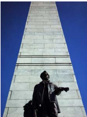
Looking up at Lincoln and the obelisk -- or is it a highway to the sky?