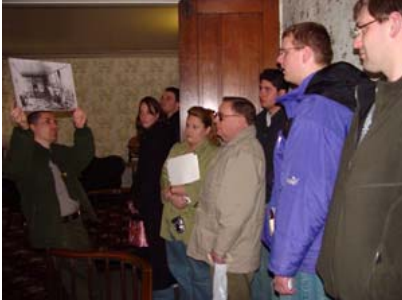
A National Park Service ranger talks about the Lincolns' last Springfield house.