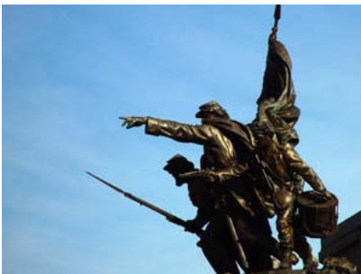
One of the four sculpture groups guarding the obelisk.