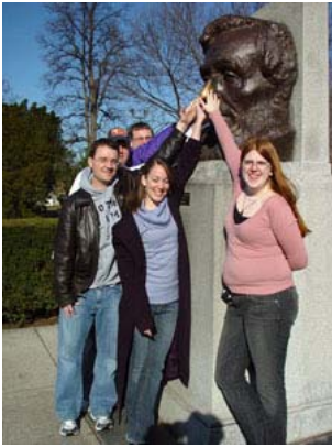
The class hopes that rubbing Lincoln's nose will give them good luck on their next history test.