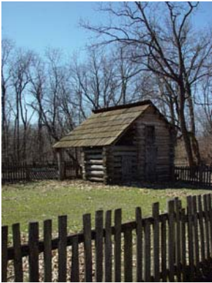
New Salem frontier cabin