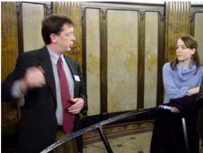
A historian with the Illinois Historic Preservation Agency tells the story of how the Lincoln Tomb was designed and built, especially to prevent grave robbers from disturbing the body. (They certainly tried!)