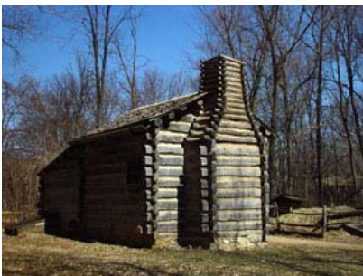
One of the houses in New Salem, where

Twelve log houses, the Rutledge Tavern, ten workshops, stores, mills and a school where church services were held have been reproduced and furnished as they might have been in the 1830s.