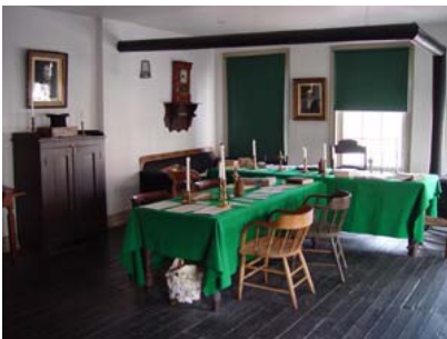
This is the third-floor office in the Lincoln-Herdon Law Offices -- a brilliant place to rent office space. It is said that the trap door in this room, which accesses the courtroom below, is where Lincoln would stretch out and listen to lawyers arguing cases. The strategic eavesdropping provided Lincoln with a fine legal education.