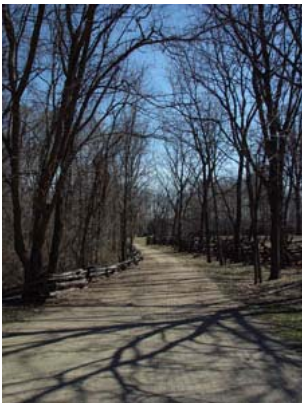
The country road to one of the stores Lincoln ran and partially owned.

The six years Lincoln spent in New Salem formed a turning point in his career. Although he never owned a home here, Lincoln was engaged in a variety of activities while he was at New Salem. He clerked in a store, split rails, enlisted in the Black Hawk War, served as postmaster and deputy surveyor, failed in business, and was elected to the Illinois General Assembly in 1834 and 1836 after an unsuccessful try in 1832.