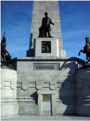
The Lincoln Tomb.