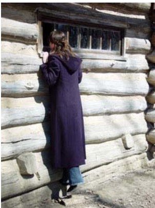
Peeking into the school house, New Salem

Twelve log houses, the Rutledge Tavern, ten workshops, stores, mills and a school where church services were held have been reproduced and furnished as they might have been in the 1830s.