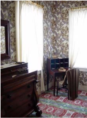
This is the real "Lincoln bedroom," in his last house in Springfield, IL. It is not unlikely that he composed his farewell address to the people of Lincoln at this desk, in early February 1861.