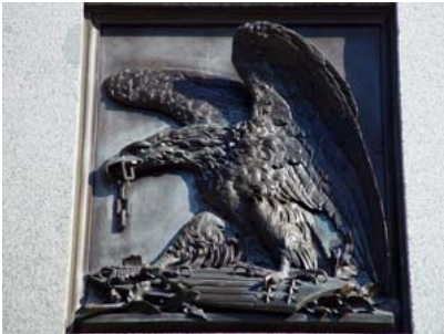
Detail at the base of the obelisk.