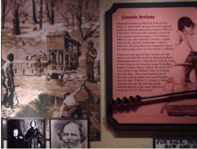
After the visit to Lincoln's Tomb, the class went 20 miles northwest of Springfield to New Salem, Illinois, where Lincoln moved as a young man, tried his hand at business, and began his study of the law.