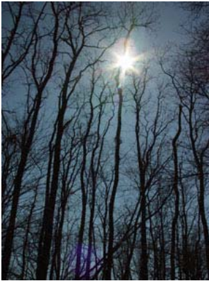
New Salem forest in late winter.