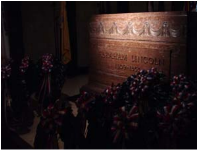
Abraham Lincoln's final resting place.