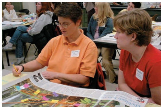
Teachers receive training throughout the year at the Lake Michigan Center.