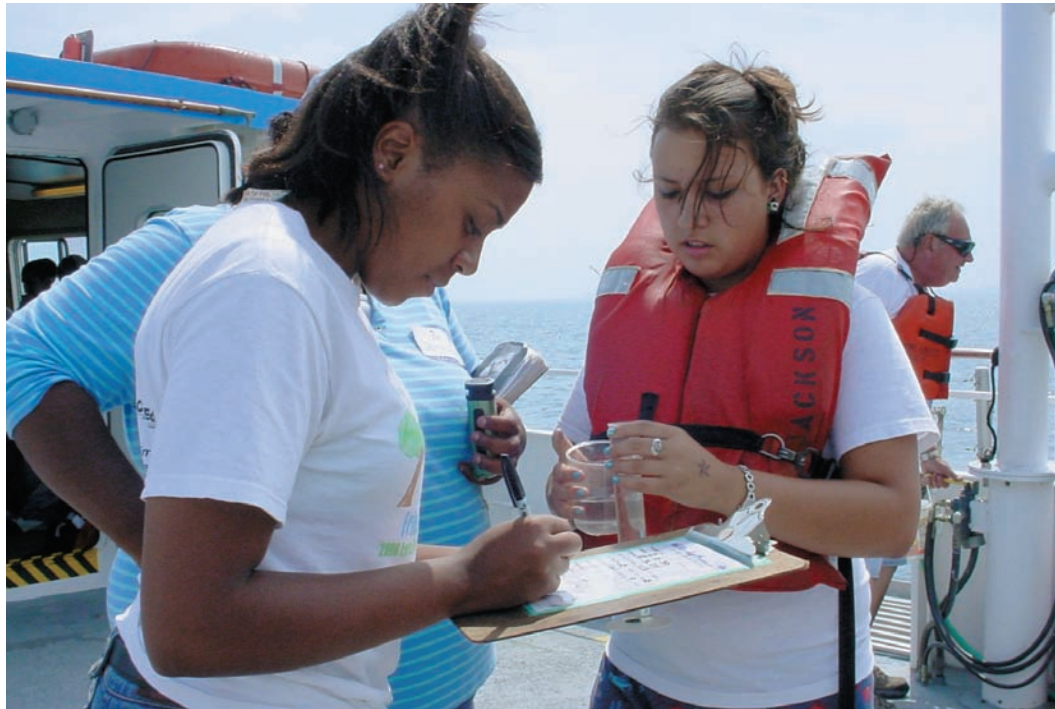
Students log data collected for use by researchers on land.