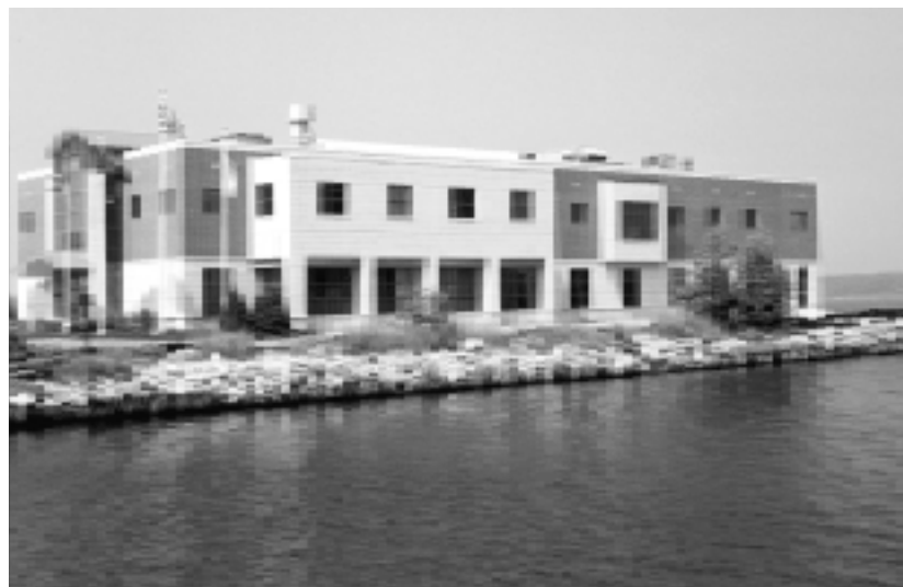
Near the shore of Lake Michigan in Muskegon, AWRI's Lake Michigan Center is in a prime location for Great Lakes research and collaborative projects.

In addition, a good graduate program will help us recruit renown scientific researchers, who are looking for institutions willing to support their work as well as give them the opportunity to teach others what they know.