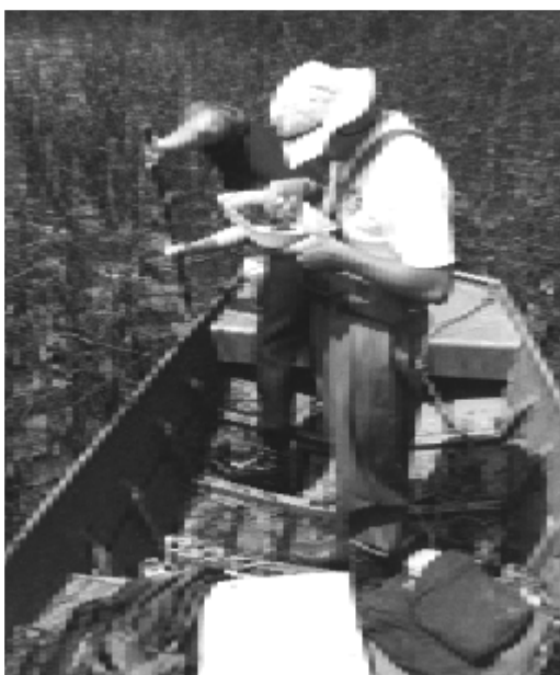
Researchers collect samples from shoreline wetlands.

Any time humans come into contact with the natural world, there are bound to be consequences or changes. One of the major contacts is development,