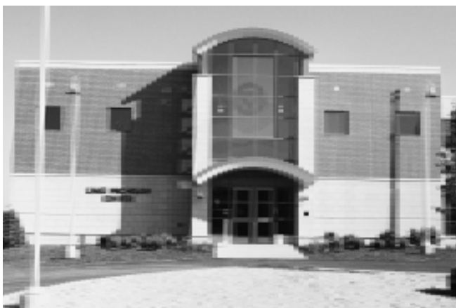
AWRI's new Lake Michigan Center was dedicated in June.