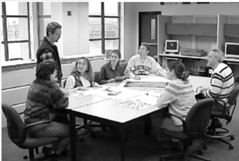
Staff in the Information Services Group review charts and graphs.

The Mega Model project is a nickname given to a project recently funded by the Great Lakes Fishery Trust. The project is formally titled, “A Collaborative Approach to Understanding the Dynamics of the Muskegon Watershed: A Comprehensive Model, Risk Assessment and Tools for Use in Management.” The project involves researchers from the University of Michigan and Michigan State University in the compilation of various computer models that are able to simulate land use change, hydrology, and complex natural communities. The idea is to package these models in a way that is useful in local decision-making. We intend to provide people with information tools that they can use to assess the environment and economic risks associated with land-use decisions. The Institute will serve as the archive for much of the data used in performing this analysis. We are also responsible for making sure the information is