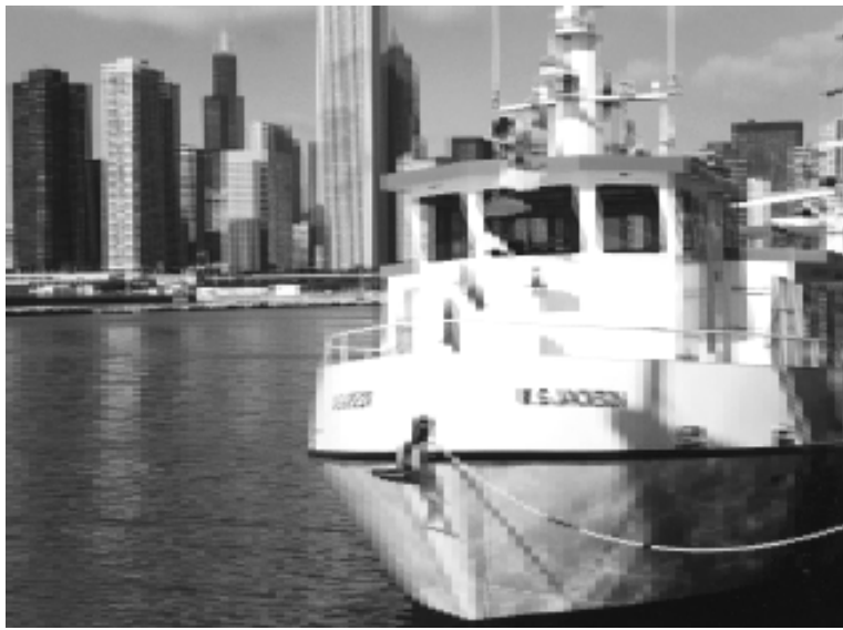
The W.G. Jackson makes a stop in Chicago on its annual tour of Lake Michigan.