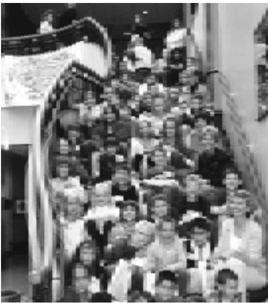
Students visit the Lake Michigan Center.