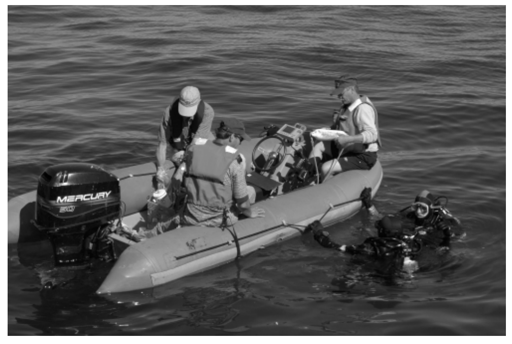
Scientists on Zodiac boats direct divers over the Middle Island sinkhole.

Since 2001 when the first submerged sinkhole was discovered, the team has identified and is studying three sinkhole communities in the Thunder Bay National Marine Sanctuary, located in Lake Huron. They postulate that sinkholes were created when the ancient limestone bedrock of Lake Huron slowly dissolved, opening up passages or holes in the rock and allowing groundwater to vent into Lake Huron. The captured and now released groundwater could be thousands of years old and constitutes a suite of highly unusual microorganisms and a chemical composition radically different from the rest of the lake.