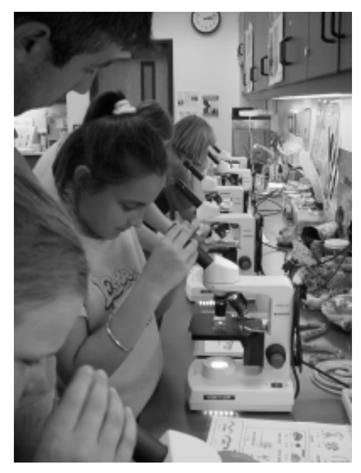
Cherry Creek Elem. students participate in educational opportunities at LMC.