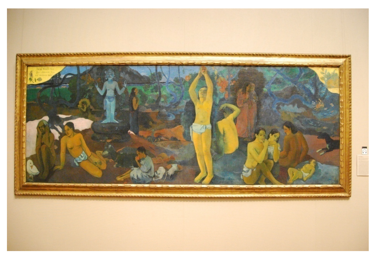
[Fig. 3] Paul Gauguin. Where Do We Come From? What Are We? Where Are We Going?

ethos among those who take up Gauguin's challenge themselves. Criticism begins with questions, questions in search for limits and possibilities. The title for the famous piece: Where do we come from? What are we? Where are we going? today in the Boston Museum of Art summons Gauguin's artistic mode