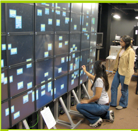
Figure 1. BABES, a tool for visualizing military intelligence data.

consisting of three PCs for moving and grouping notes as well as labeling the resulting hierarchy. The tool lacks a large display to enhance collaboration and increase awareness of the workspace. CDTools [1] by InContext provides support for organizing customer data into Post-it® notes and capturing the affinity after it has been built. An affinity diagram is captured by organizing notes in a list according to the hierarchy of the diagram. These types of tools support capture of information, but do not solve all the problems and needs in the current process (Table 1).