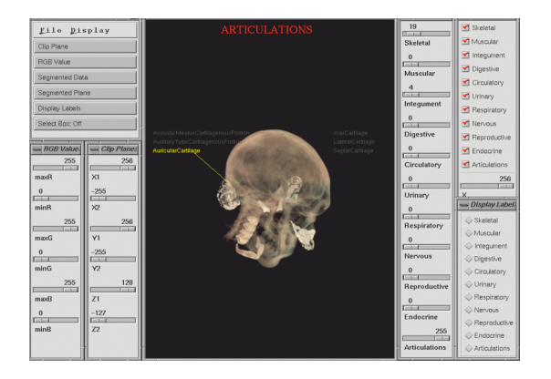
Figure 3. SGI 3D data visualization interface

functionality was maintained across the two platforms, due to the differences between the two operating systems used, the look and feel of the two different applications was substantially different. On the Tablet PC, standard windows widgets were used, including tabbed windows and collapsing menus. On the SGI machine, the interface