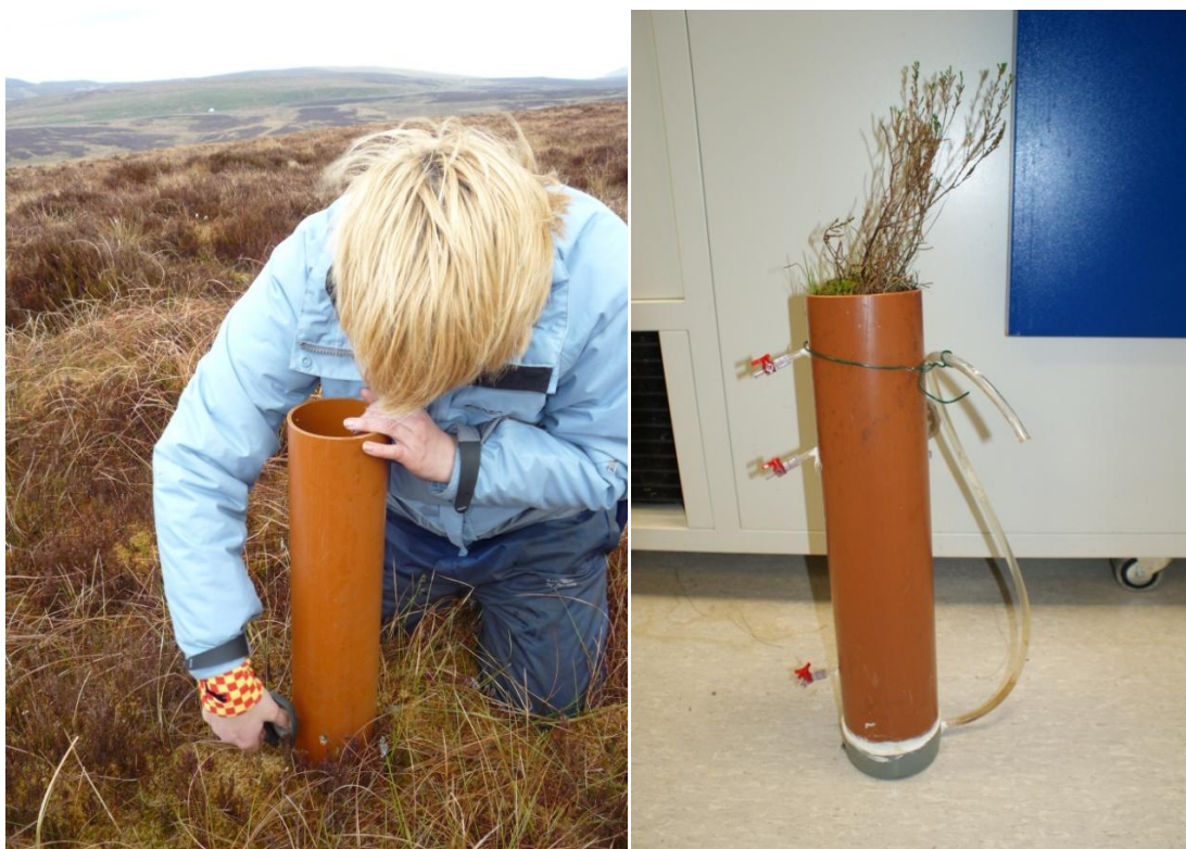
Figure 2.1. The sampling technique (left) and sample holders (right) used in the controlled-environment study.

Within a few hours of collection, the PVC holders were capped at the base and fitted with pore-water sampling ports (at depths of 5, 15 and 40 cm) (Figure 2.1). The pore-water ports consisted of a three-way valve attached to a 1 mL perforated syringe packed with glass wool (to provide filtration of macro particles) via tubing. The bases were fitted with over-flow tubes that allowed us to manipulate water levels within the samples (see Figure 2.1).