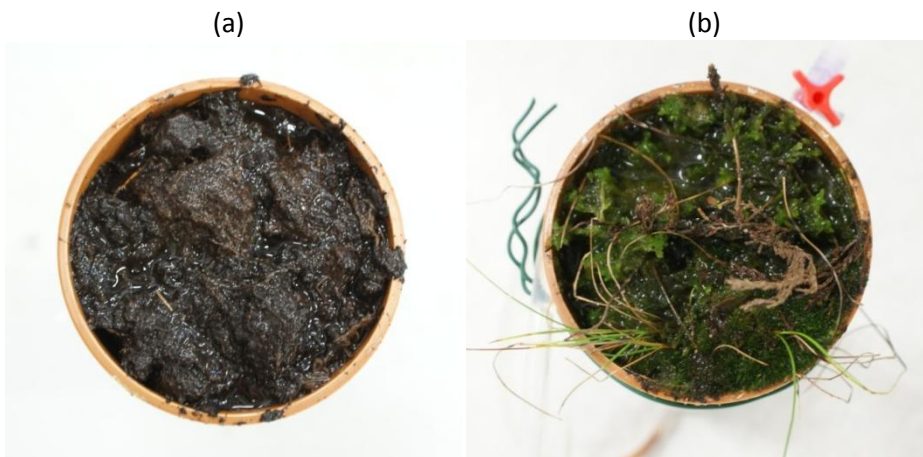
Figure 3.1. A re-profiling core, illustrating the change in vegetation cover over time. Photograph (a) 12 th July 2010 (week 1 of experiment) and (b) 22 nd April 2011 (week 39).