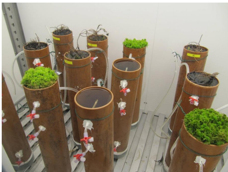
Figure 1.2. A selection of the peat samples (mesocosms) from Experiment 1.

Respiration from peat mesocosms can increase cabinet \text{CO}_2 concentrations to values in excess of 500 ppm, thus rendering the results of incubations unreliable (such high concentrations are not usually seen in the field). Therefore, ambient \text{CO}_2 concentrations were maintained at 380 ppm ( \pm 50 ppm) , a level found in well-mixed (windy) conditions in the field. The ability to control above-canopy \text{CO}_2 concentrations was identified as a major advantage of our experimental design in our original proposal to Defra. Without such \text{CO}_2 control, the mesocosms would have experienced unrealistic \text{CO}_2 concentrations in the region of 450-700 ppm, with the likely effect of artificial stimulation of \text{CH}_4 emissions.