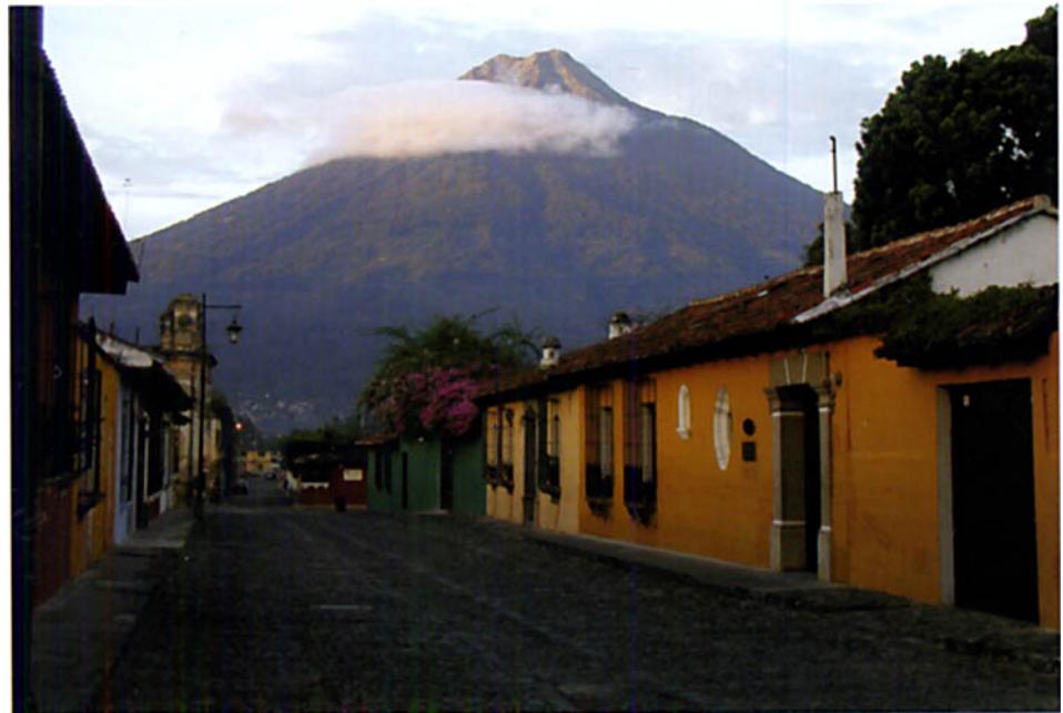
Figure 1: A typical street scene in Antigua, Guatemala. Antigua was founded on March 10, 1543 and first named La Muy Noble y Muy Leal Ciudad de Santiago de los Caballeros de Guatemala (the Most Noble and Most Loyal City of St. James of the Knights of Guatemala) or La Antigua for short. In the background lies Agua Volcano (3,765 meters above sea level).

With a current population of around 32,000 people, Antigua rests in the picturesque Panchoy valley and covers roughly the same geographic area as it did during its colonial golden era. In 1979, Antigua's unparalleled architecture and splendid setting earned it a place on UNESCO's (United Nations Educational, Scientific, and Cultural Organization) list of World Heritage Sites. As UNESCO