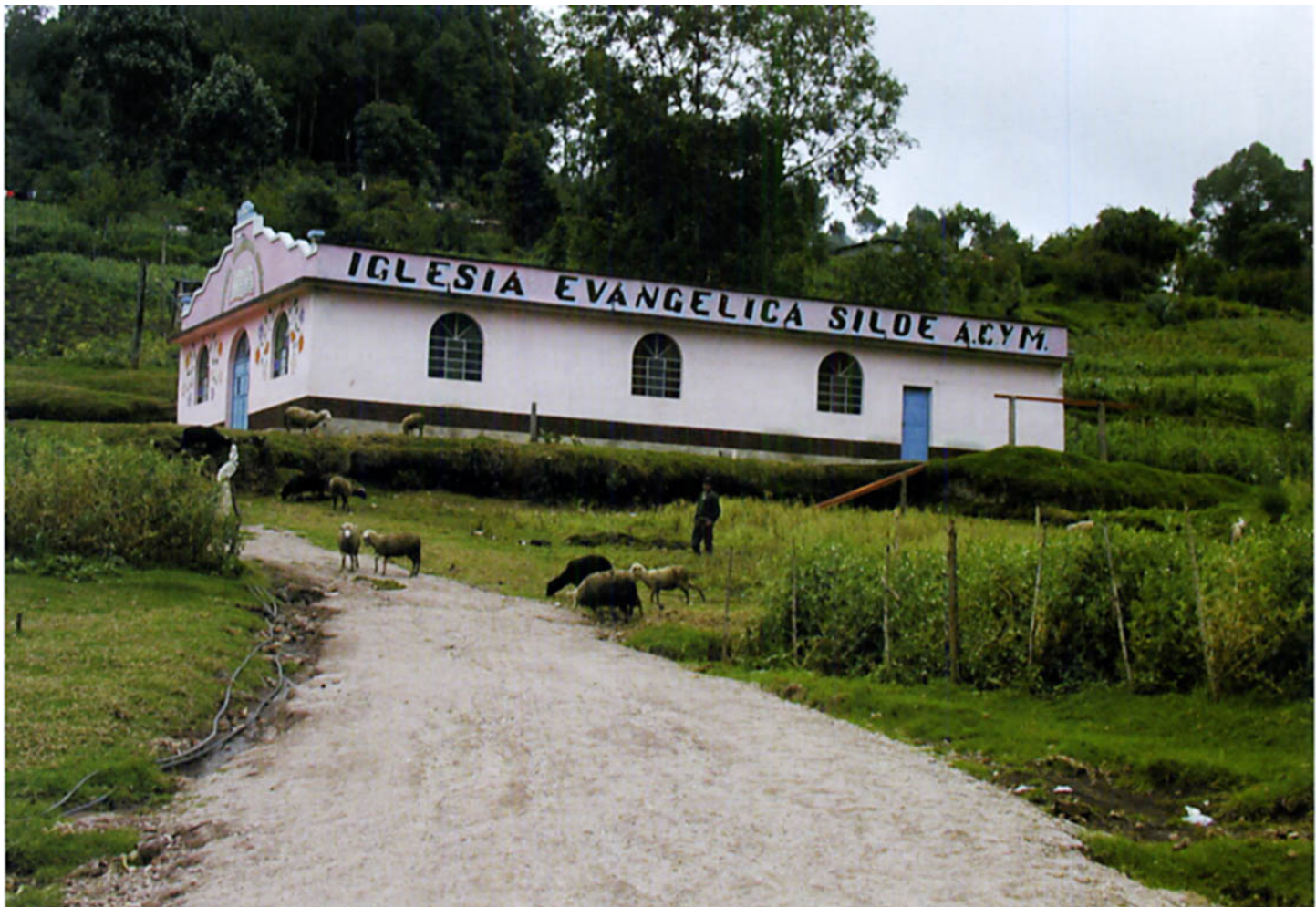
Figure 25: One of many Protestant churches seen on the road between Antigua and Lake Atitlan.