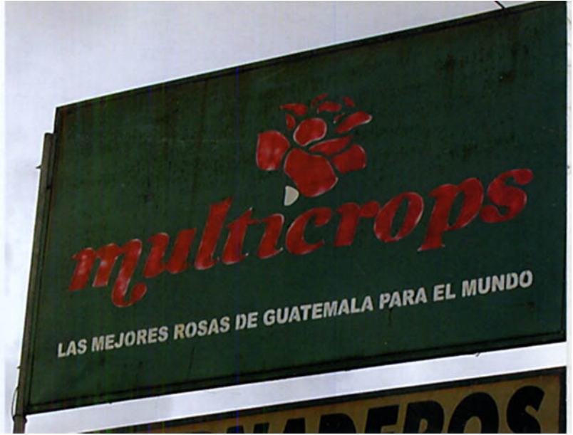
Figures 8 and 9: Modern greenhouse raising roses for the world market. The sign reads, "The best roses of Guatemala for the world."

examples of modern agricultural operations. One grows vegetables, including broccoli, cauliflower, and lettuce, for export to the world market. This operation utilizes the latest in modern farm equipment, including a drip irrigation system to deliver water to each plant. The other example is a state-of-the-art plantation which raises decorative flowers. Inside climate controlled greenhouses grow some of Guatemala's most prized roses (Figures 8 and 9).