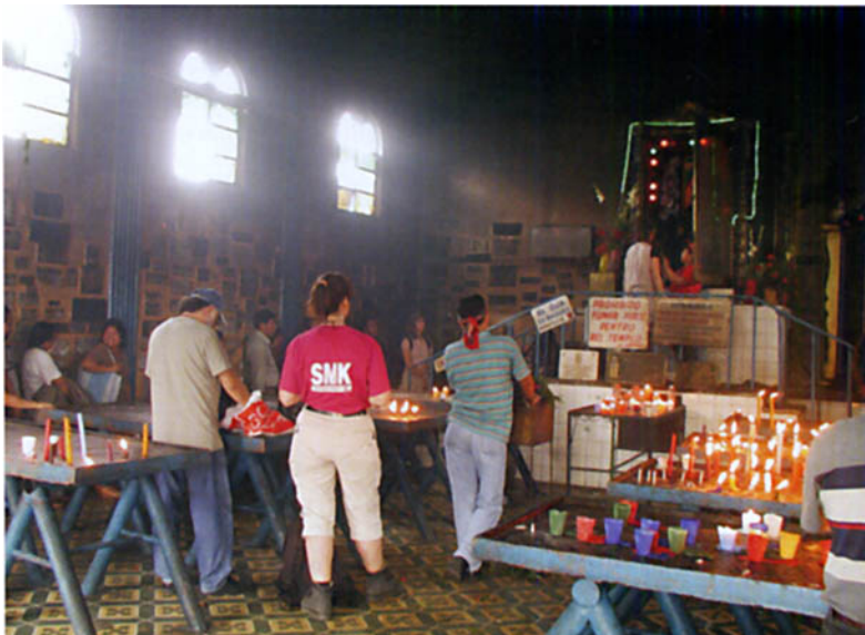
Figure 19: Altar inside Chapel of San Simon in San Andres de Itzapa, Guatemala. A Curandera cleanses a worshiper by spraying him with alcohol from her mouth. A statue of Maximon sits in a wooden chair with a painting of Our Lady of Guadalupe behind him.