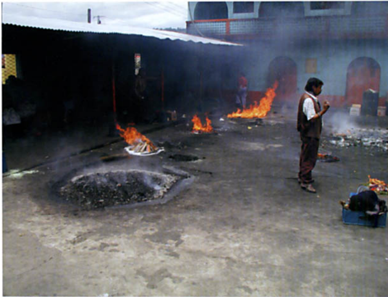
Figure 16: Small, incense-laden bonfires in courtyard in front of Chapel of San Simon. Bonfires are used to cleanse the body and soul by waving hands through smoke.