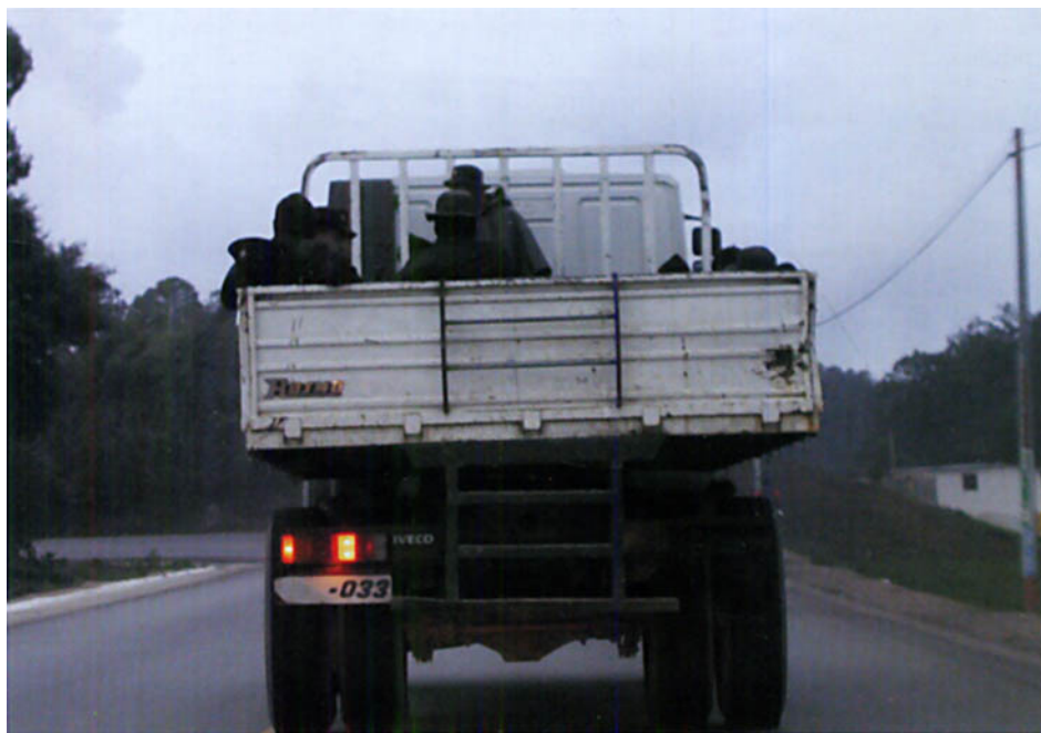
Figure 21: An unmarked military truck with masked men on the road between Antigua and Lake Atitlan in the highlands of Guatemala.