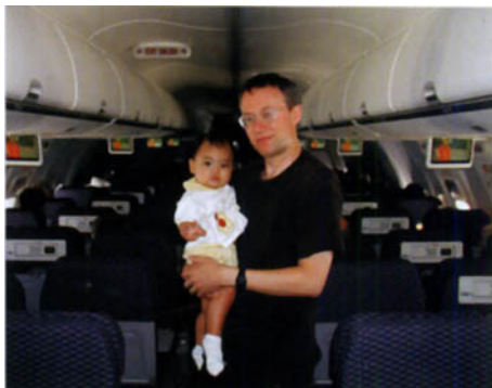
Figure 20: An unidentified man with his newly adopted Guatemalan baby girl flying back to the U.S. after completing the adoption procedure.

Guatemala has one of the greatest disparities in income and land ownership in Latin America. According to an article that appeared in the May 17, 2003 issue of The Economist , a scant 3% of Guatemala's population owns over 65% of the land, and 10% of all Guatemalans earn 47% of the household income. Moreover, 90% of Guatemala's Indian population lives in "poverty" (the U.N. defines poverty as earning less than $2/day), and nearly 70% of the Indians live in "abject poverty" (defined as earning less than $1/day). Resulting from this pronounced poverty, many families, especially Mayan, do not have the financial resources to care for their children. Guatemala has become known as one of the leading adoption-sending countries in the world, and the main source of intercountry adoption is through birth parent relinquishment (Figure 20). According to Bethany Christian Services (an