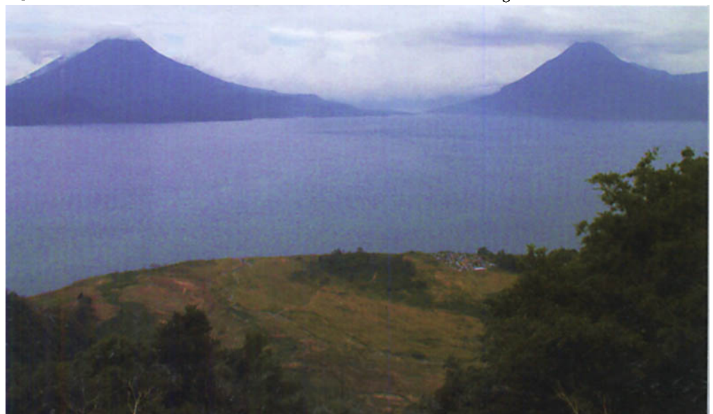
Figure 3: Lake Atitlan and volcanoes San Pedro and Toliman in background.