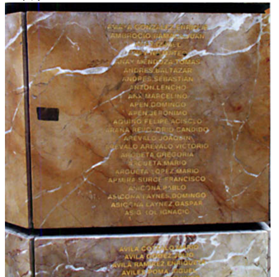
Figure 24 : (A) A view of the main Catholic Cathedral in the central plaza in Guatemala City. (B) A photo of the pillars that line the cathedral's courtyard. (C) Some of the names of the victims of the 36-year civil war in Guatemala have been engraved on the pillars by the Church.

missing. The lists of names are as long as the pillars are high, and new names are continually being added as more information comes to light. As Steinberg and Taylor note, the Catholic Church has been one of the most outspoken voices against governmental oppression, and these pillars speak volumes for the victims. Maybe by posting the names, the Catholic Church is bringing closure to the war and helping to begin the healing process.