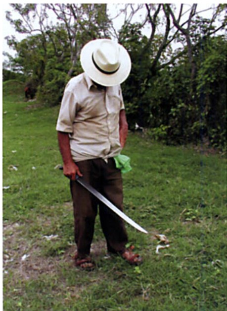
Figure 22: An older Mayan man willing to have his photo taken but uncomfortable having his face captured.

While on another field trip, I encountered an older man grazing his livestock alongside the road. After a conversation with the unidentified man, I asked him if I could take his picture. He agreed, but immediately dropped his head and held forth his machete (Figure 22). I invited him to lift his face to the camera, but he declined. After the camera was put away, he explained that he did not want a photo of his face taken, because he was afraid it might end up on a governmental hit list. It is evident that the wounds left by the war are still raw.