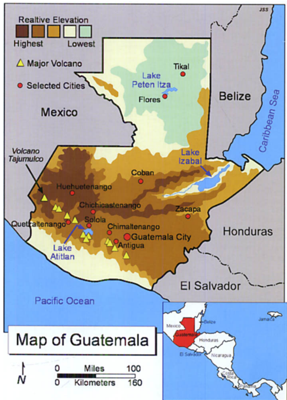
Figure 2: Map of Guatemala. Adapted from GraphicMaps.com. Cartography by author.

Although being located in the heart of a volcanic axis has its challenges, local Guatemalans are blessed with some of the