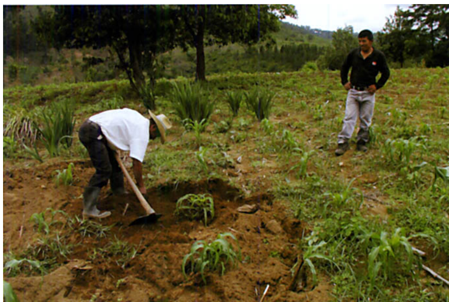
Figure 5: Campesino hoeing his cornfield growing out of the rich volcanic soils.