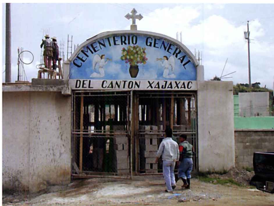
Figure 13: Traditionally dressed Mayan men working in a community cemetery with younger Mayan men dressed in "western" clothing at the entrance.