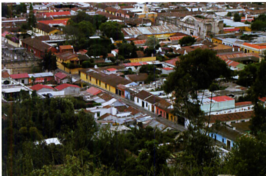
Figure 4: "Earthquake Baroque" architecture in Antigua, Guatemala.