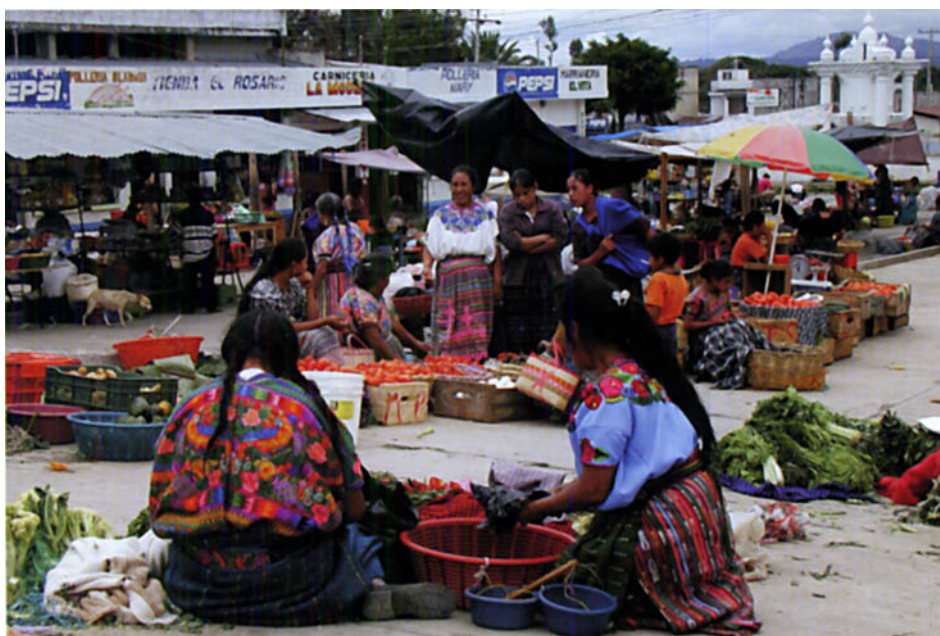
Figure 14: Open-air market in San Andres de Itzapa with Mayan women wearing traditional traje.

future. Maximon has also become known as the saint whose powers are most effective in dealing with disputes with a Ladino or with the government. His popularity became most pronounced in the highland villages around Lake Atitlan, especially in his home community of Santiago de Atitlan. It is reported that because of Maximon's power and influence among the local Mayan Indians, some of the bloodiest battles during the Guatemalan civil war