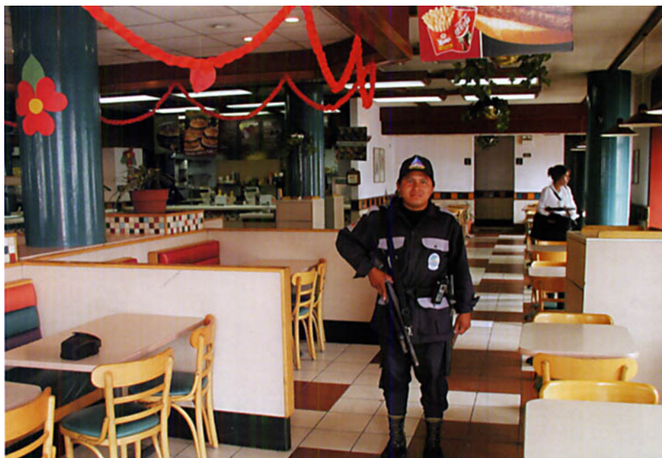
Figure 23: A young man serving as guard in a Wendy's Restaurant in Guatemala City.

Another common Guatemalan scene that was unexpected was the prevalence of heavily-armed guards in front of banks and key businesses. The guards ranged in age from their late teens to their late 50s, and they all stood sentry carrying an automatic weapon. Even at the Wendy's restaurant just off the main Plaza in Guatemala City, a young man guarded the establishment with a high-powered rifle (Figure 23). Later, I was informed that only a handful of their guns are loaded, but their presence clearly