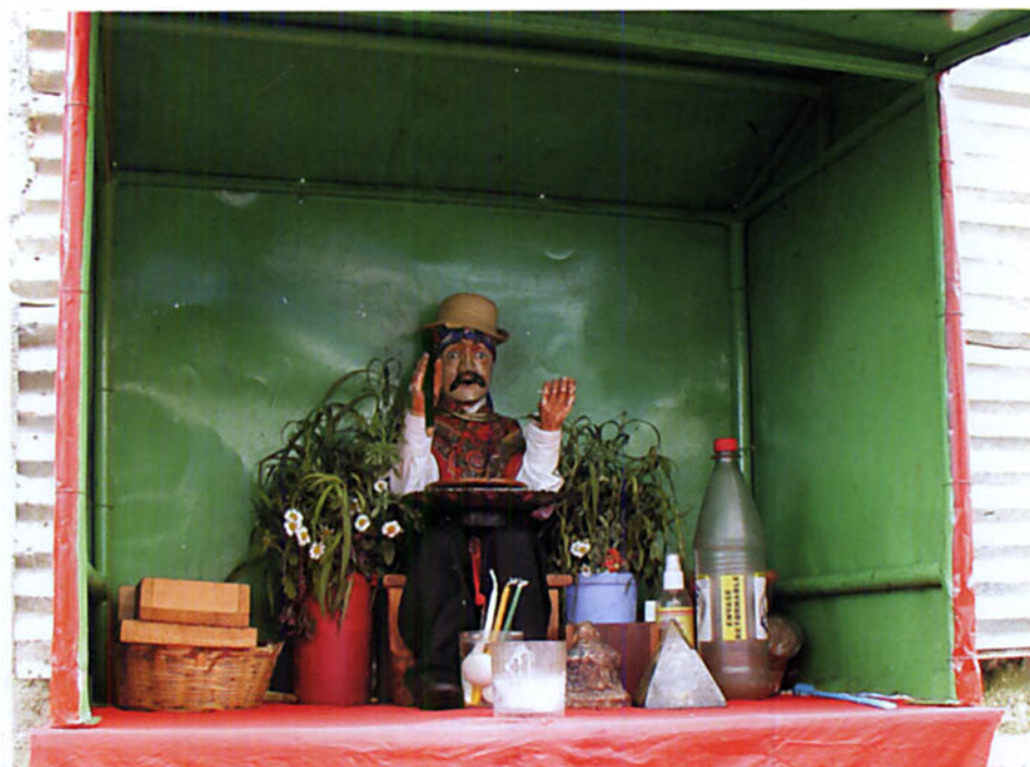
Figure 15: Statue of San Simon in a small shrine outside the Chapel of San Simon in San Andres De Itzapa, Guatemala.