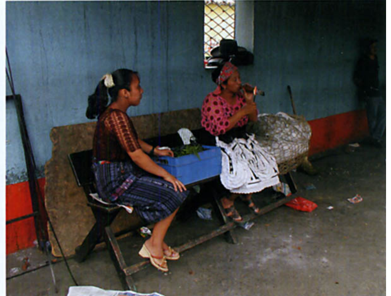
Figure 17: Older Mayan woman smoking a cigar in courtyard outside Chapel of San Simon in San Andres de Itzapa, Guatemala.

were fought in the highland region around Lake Atitlan. Other villages where chapels have been built in honor of Maximon include Zunil, San Lucas, Patzun, Nahuala, and San Andres de Itzapa. A visit to the Chapel of San Simon in San Andres de Itzapa is truly an eye-opening experience.