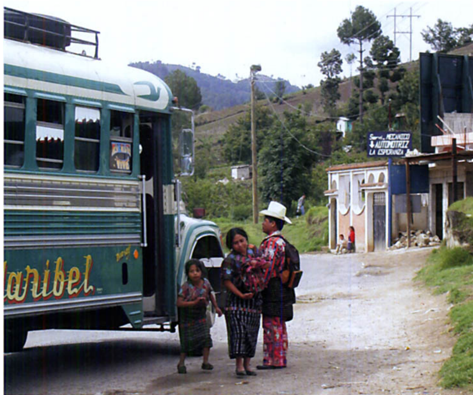
Figure 12: Mayan Indians in traditional dress at a bus stop near Solala, Guatemala.