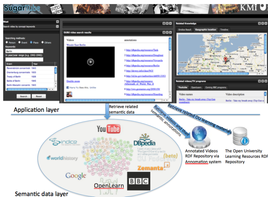
Fig. 3. SugarTube browser (top) and architecture (bottom)

Annotated video Recording). The SugarTube interface and system architecture is illustrated in Figure 3. The SugarTube architecture has two layers: the application layer, responsible for presentation and interaction, and the semantic data layer which finds and integrates data that has been published in the LOD cloud by different organisations, including annotation data from Annomation. The Semantic Web data is obtained through RESTful services and SPARQL endpoints. The application layer allows the user to query and navigate the video search results using the semantic data (e.g. related knowledge, concepts, videos, and learning materials).