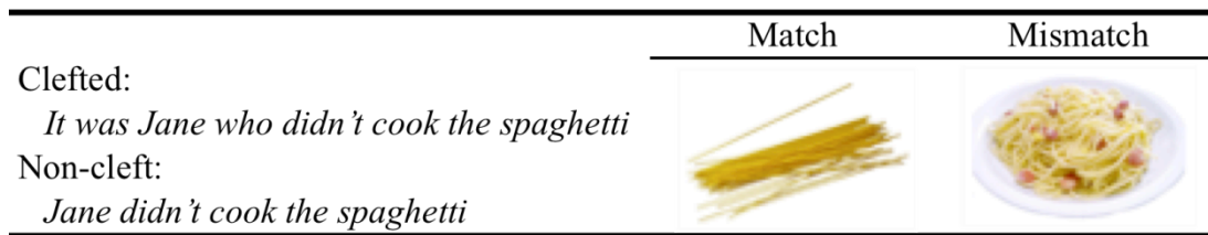
Table 1: Example experimental sentence and the associated visual displays, as labelled.

One version of each sentence-picture pair was assigned to one of four presentation lists, with each list containing twenty-eight experimental items. Each list contained one of the four possible versions of each item (2 (clefted/ non-cleft) x 2 (match/ mismatch)), blocked to ensure that they were evenly distributed among the fifty-six fillers. Each participant only saw each item once, in one of these four lists. Participants' task was to decide whether the object in the picture had been mentioned in the preceding sentence. All experimental trials required a ‘yes’ response. Finally, comprehension questions