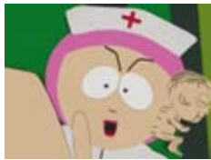
Fig. 3. 'Conjoined fetus lady', in episode 18 of Comedy Central's animated series South Park. First broadcast on 3 June 1998.

"But when other adjectives are used alongside it, and it's done to vilify or abuse somebody, then it's not acceptable... Everybody's sensitive about their background and identity, even the largest cultural group within our community."