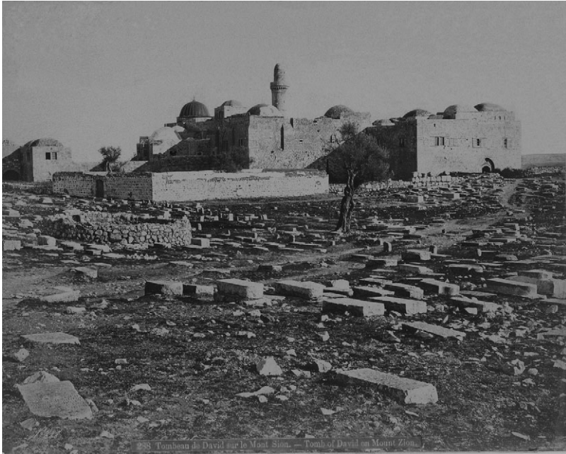
Figure 2: Félix Bonfils (or workshop), “Tombeau de David sur le Mont Sion – Tomb of David on Mount Zion” (albumen print, c. 1870–1880; University of Pennsylvania Museum, image #165606).

first sight, perhaps enticing the casual browser to buy the book and certainly suggesting a particular and (it may be suspected) familiar discursive framework. In fact, it will appear that the cover design fulfils its function of introducing the literary text and its central motifs very well indeed and, although magnificently lacking in subtlety, proves to be a very “clever” piece of work.