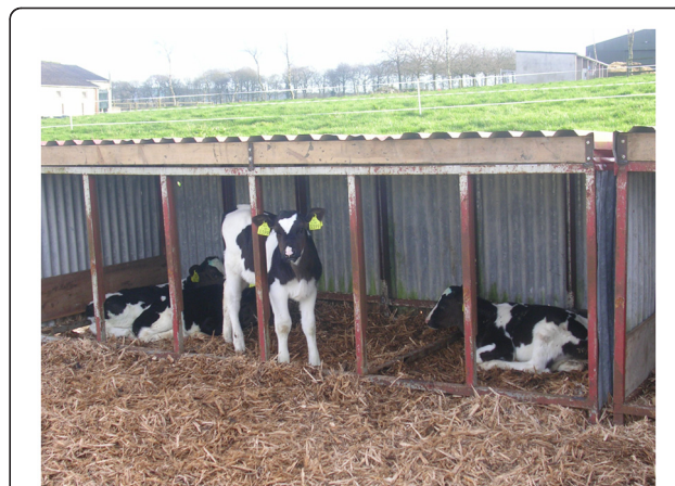
Figure 1 Calf milk feeding using a mobile teat feeder.

Experiments 1 and 2 were conducted in years 2007 and 2008, respectively, with a number of common calf rearing procedures used for both experiments. Calves on each treatment were penned in groups of nine and each treatment group was replicated. Group pens were filled before calves were assigned to the next treatment group. This method was used to assure equal age profile within pens and to maintain a stable number of calves within each pen. This method also facilitated weaning steps. All calves were fed twice daily with colostrum for 3 days and then whole milk until day 10. Calf feeding times were 0900 h for OD calves and calves fed TD were offered their second feed at 1530 h. Whole milk was collected daily, during milking for calf feeding, after plate cooling (milk temperature ranged from 10°C to 15°C). All calves were fed using mobile teat feeders (not individually sub-divided) suspended on the gate of each pen or paddock (Figure 1). After each feeding occasion milk teat feeders were removed and washed with running water. Calves, offered WM twice daily, received 2.25 liters of milk at each feeding time. Calves offered WM once daily received 4.5 liters of milk at the morning feeding time. Electrolytes were added to water and offered to calves where calf diarrhoea was diagnosed. Calves