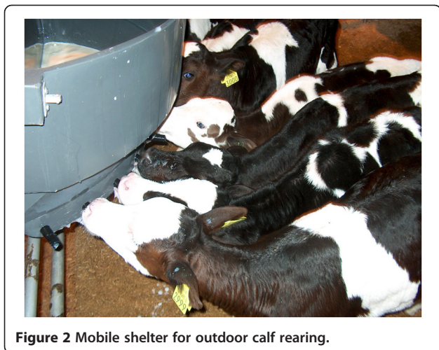
Figure 2 Mobile shelter for outdoor calf rearing.

Daily health parameters such as calf diarrhoea, group diarrhoea (entire pen showing clinical signs of diarrhoea), pneumonia and deaths were recorded up to day 80. Individual calf LW was recorded at the start day (day 10) and weekly thereafter until day 80 using a mobile weighing scales (Tru-test Ltd, Auckland, New Zealand). Animal LW results are presented fortnightly. In addition, maiden heifers were weighed on one occasion prior to start of the breeding season and individual