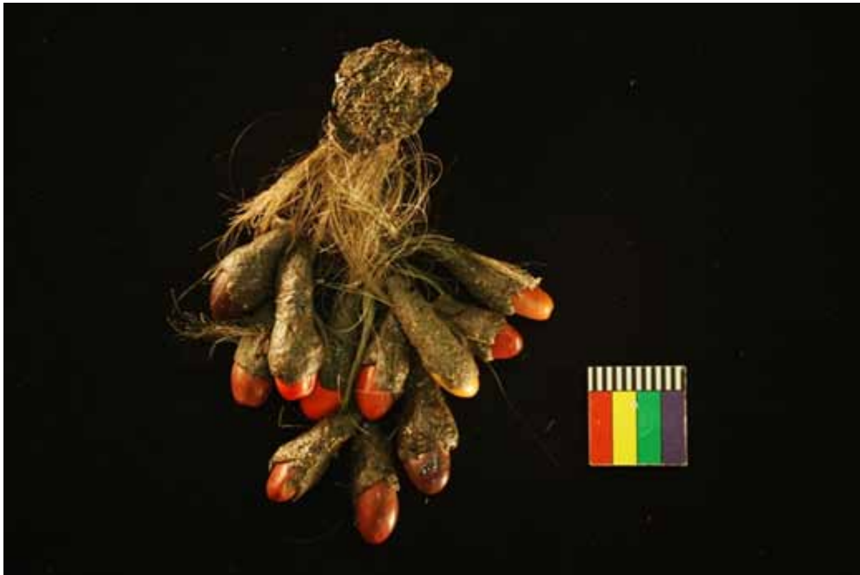
Figure 4. Personal adornment object of unknown date made from Erythrina vespertilio Benth. seeds attached to human hair using spinifex resin. Thought to be from the Dalhousie Station in the Northern Territory, Australia. Currently held in the South Australian Museum collection (A60598). [Photographer: Heidi Pitman].