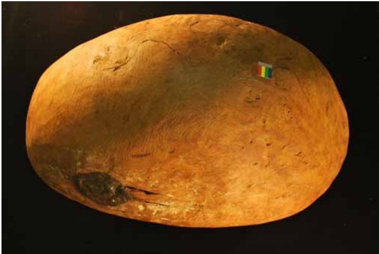
Figure 2. Wooden coolamon collected in 1971 by Robert Edwards from Ernabella Mission, Australia, showing spinifex resin repair. Currently held in the South Australian Museum collection (A62362).

As noted, the most common use of spinifex resin was as an adhesive for joining materials together to form com-