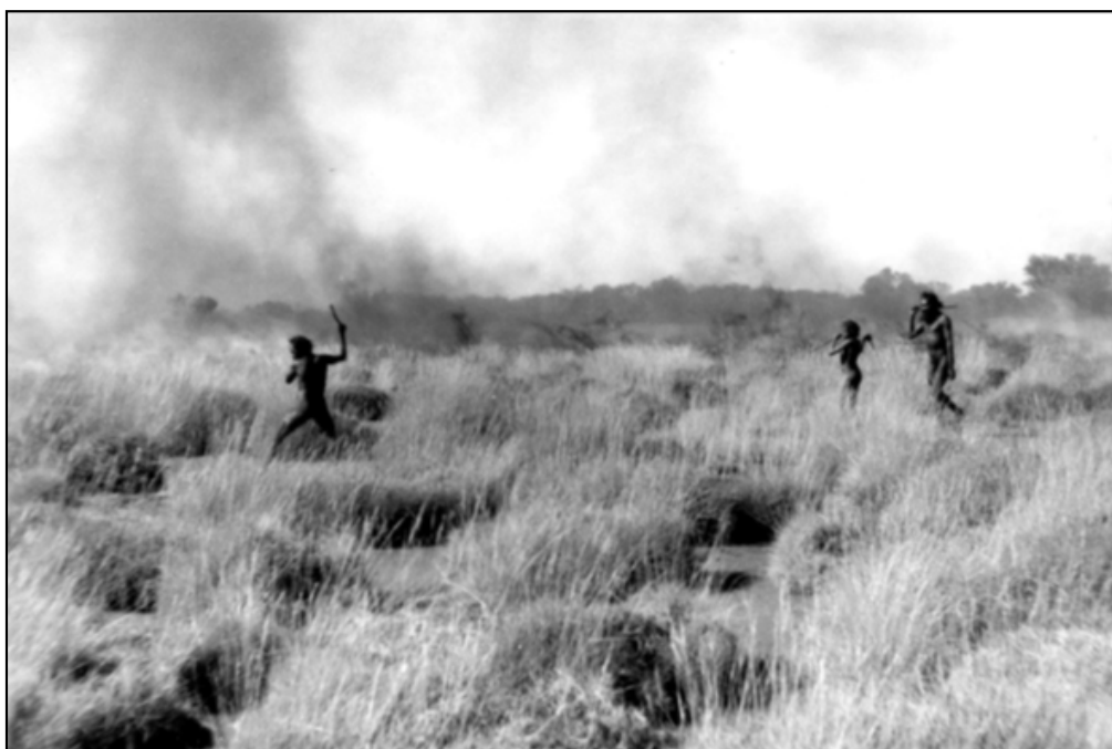
Figure 11. Aboriginal people in the Musgrave Ranges of South Australia using fire in a spinifex grassland to hunt mala. Photograph taken by H. Finlayson in 1933 (Ara Irititja Archive P57646). [Image courtesy of Ara Irititja Archive].

Areas of spinifex were burnt to direct animals so that they could be easily caught and killed (Chewings 1936:40, Finlayson 1933; see Figure 11), flushed into open areas, in the case of ground living animals smoked from their bur-