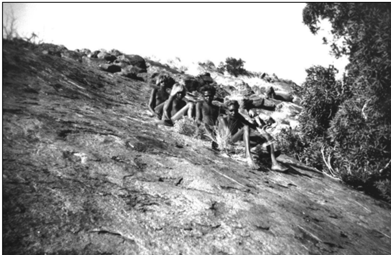
Figure 12. Aboriginal children sliding down a rock-face on a clump of spinifex. Photograph taken by Dutschke near Ernabella, South Australia in 1951 (Ara Irititja Archive P9836). [Image courtesy of Ara Irititja Archive].

Cane (1987:403, Table V) noted that after collecting Chenopodium rhadinostachyum F.Muell. and Chenopodium inflatum Aellen seeds, spinifex is burned and the resulting ash rubbed together with the chenopod seeds before they are winnowed. This was reportedly undertaken in order to remove the "aromatic flavour of the plant and the herbaceous material surrounding the seeds", a necessary step