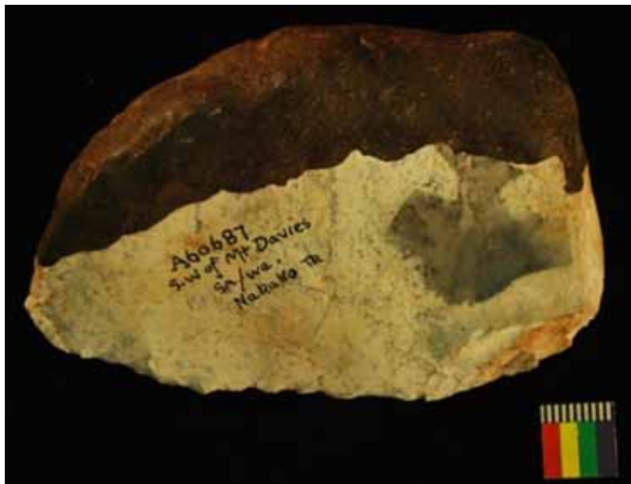
Figure 3. Stone blade with spinifex resin to facilitate handling collected by Norman Tindale from Mount Davies in South Australia in 1970. Currently held in the South Australian Museum collection (A60687).

One final, unusual use of resin in this category was observed by Spencer and Gillen (1899:588) who described how star- or sometimes irregularly-shaped patches of resin were inserted into the wood of shields. They recorded these as having no functional use but rather as being purely for ornamentation purposes.