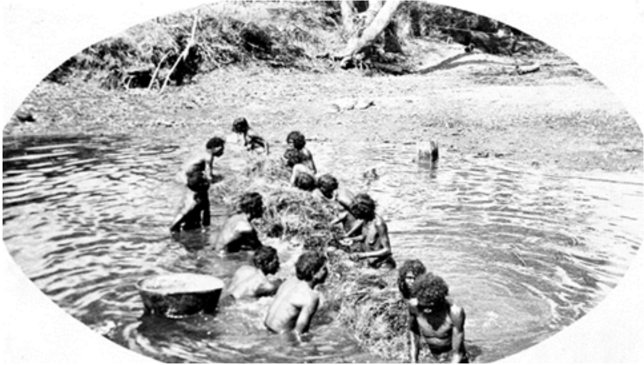
Figure 10. Aboriginal people fishing using a moveable wall of spinifex plants to herd and catch fish in a river of the Kimberley, Western Australia in the early twentieth century.