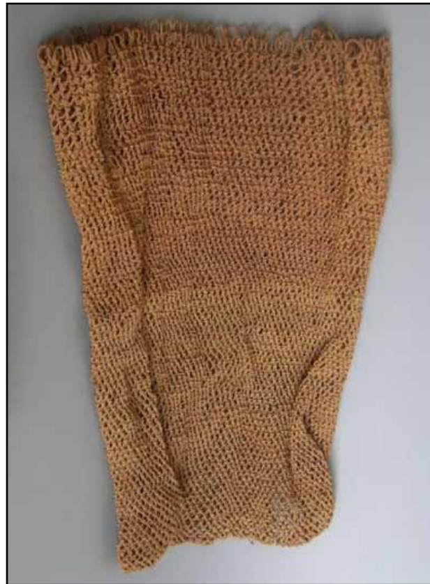
Figure 8. Bag made from spinifex fiber collected by Emile Clement from north Western Australia in the late nineteenth century, now held in the British Museum (Oc1960,11.63).

Although other written references to spinifex fibers are scarce, Sherlock River and Roebourne feature strongly in relation to spinifex nets ( tukurra/tarurra ), bags and raw material samples held in overseas museum collections collected by Clements (e.g., BM Oc1960,11.63, PM 23-46-70/D1728, PRM 1898.75.7.1, REM 1321-29; see Figures 8 & 9). Additionally, a spinifex fishing net and raw material used in its manufacture were also collected by Radcliffe-Brown from north Western Australia (CMAA E1914.70.65). In Australian museums, there are similar examples of spinifex string, bags and nets collected from Chiratta Station (near Roebourne) (e.g., WAM E08215, 00604), along with a spinifex net and two spinifex bags (WAM E00350-52) from an unspecified north Western Australia locality. The Berndt Museum contains a bag woven from sedges that contains a “net made from twine of