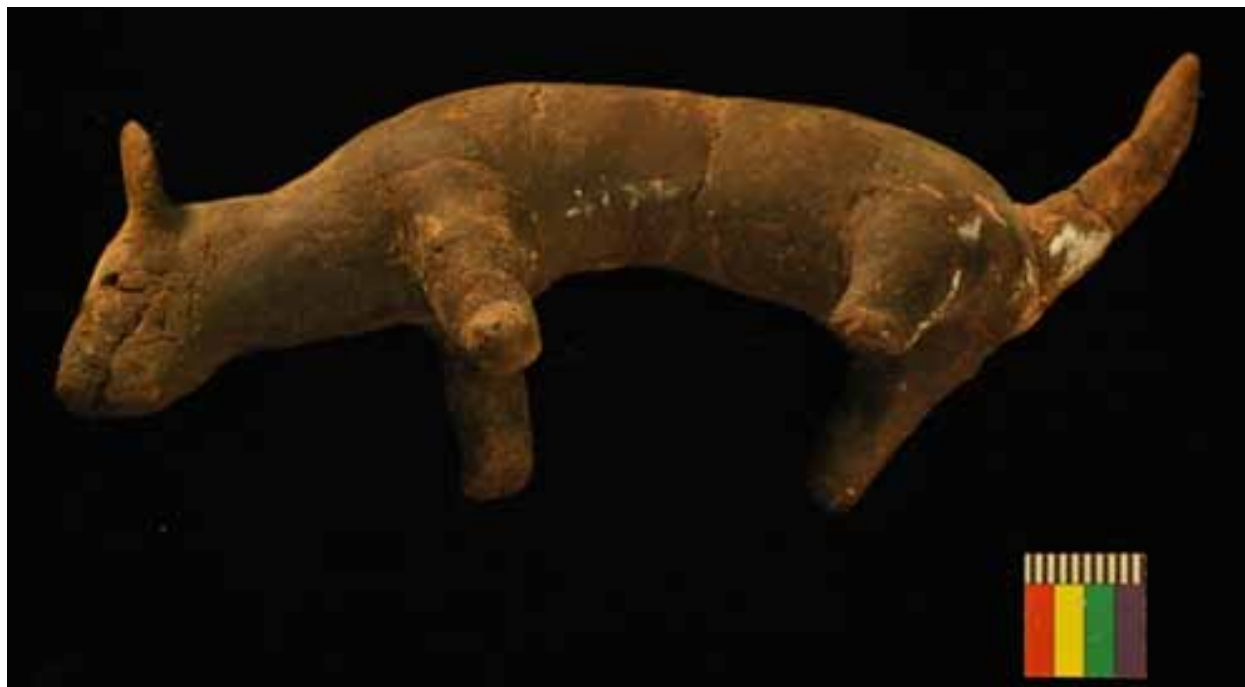
Figure 6. Figure of a dog belonging to an Ancestral Being probably crafted from spinifex resin. Collected by Reuther from the Killalpaninna Mission area in the Lake Eyre Basin, South Australia in the late nineteenth century. Currently held in the South Australian Museum (A68460).

are said to represent the metamorphosed testicles of the Great Kangaroo Ancestral spirit whose creative pathway crossed through the Blood Range area of Central Australia.