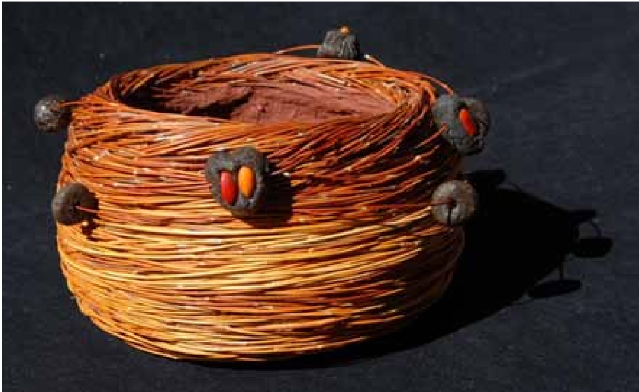
Figure 5. Contemporary basket made using spinifex stolons with ochre lining and spinifex resin beadwork with Erythrina vesperilio Benth. seeds, crafted by Shirley McNamara in northwest Queensland, Australia. [Photographer: Lynley Wallis].

Camooweal in northwest Queensland) artist Shirley McNamara has fashioned small balls of spinifex resin and incorporated them into her basketry (Figure 5). Likewise, Central Australian weaver Pantjiti Lionel incorporated spinifex resin in her raffia sculptures (NMA 2001.0018.0001, 2001.0018.0002). While the aforementioned objects are contemporary, there are some indications to suggest resin figurines may have a longer antiquity. For example, seven dog figurines crafted probably from spinifex resin, some decorated with white clay and red ochre, are held in the South Australia Museum (SAM A422-A428; Figure 6). These were collected from the Killalpaninna Mission area in the Lake Eyre Basin in the late nineteenth century and each represents an individual dog which belonged to particular Ancestral Beings in Lake Eyre mythology (see Jones & Sutton 1986:13, 136-137, Nobbs 1985:17).