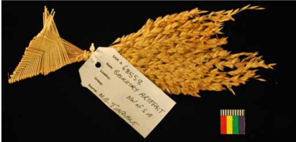
Figure 7. Basketry object made by Jackie Bellrock using spinifex seed stalks. Collected by Norman Tindale in the northwest of South Australia in 1966. Currently held in the South Australian Museum (A68558).

documented such a use around the Sherlock River in north Western Australia: