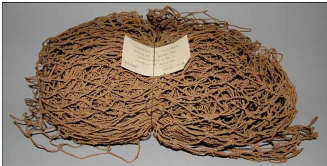
Figure 9. Net made from spinnifex cord collected by Emile Clement from the Sherlock River region of north Western Australia in the late nineteenth century, now held in the British Museum (Oc1960,11.59)..

spinnifex grass" (BeM 6355.00) thought to have been collected from the Cossack area of Western Australia.