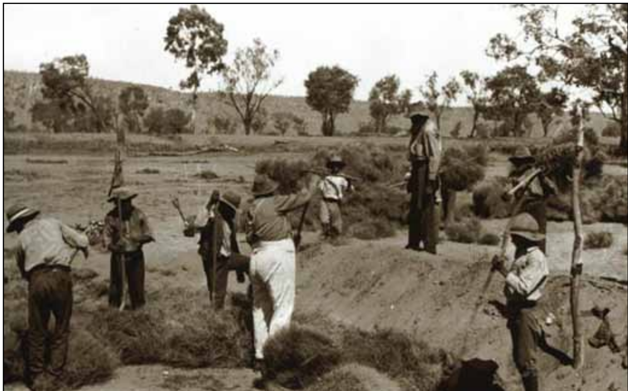
Figure 13. Workers laying spinifex during road construction in Central Australia 1912-1951. Photograph is part of the Australian Inland Mission Collection (nla.pic-an24666817).

Generally avoided wherever possible by explorers, cursed by the surveyor, used only as a drought reserve by the pastoralist and its recent spread lamented by ecologists, it is difficult to find a favorable reference to spinifex. However, as our research has identified, these ubiquitous and characteristic Australian plants were highly valued for their functionality and versatility by Aboriginal people in the past and remain so today.