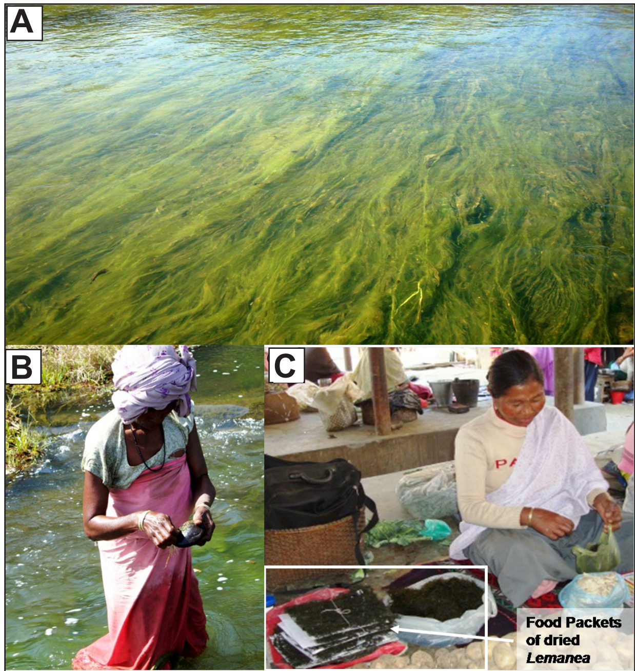
Figure 3. Habitat, collection and selling of the alga. A: Lemanea fluviatilis (L.) C.Ag. colonized in the river during peak of winter season. B: Tribal woman collecting the alga in the Chakpi river. C: Tribal women selling L. fluviatilis in a Meitei community market, Manipur, India.