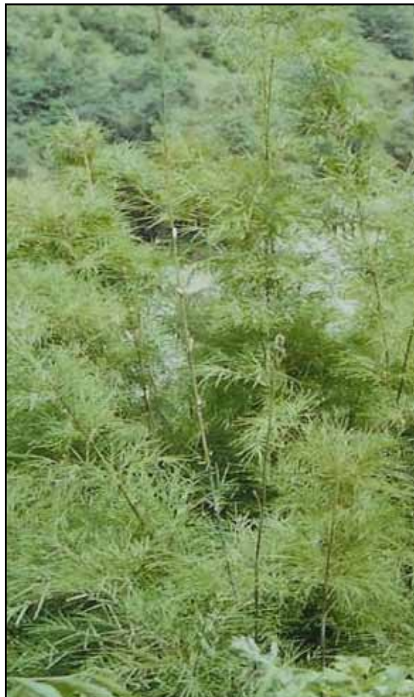
Figure 2. Ringal-bamboo plant, Uttarakhand, India.