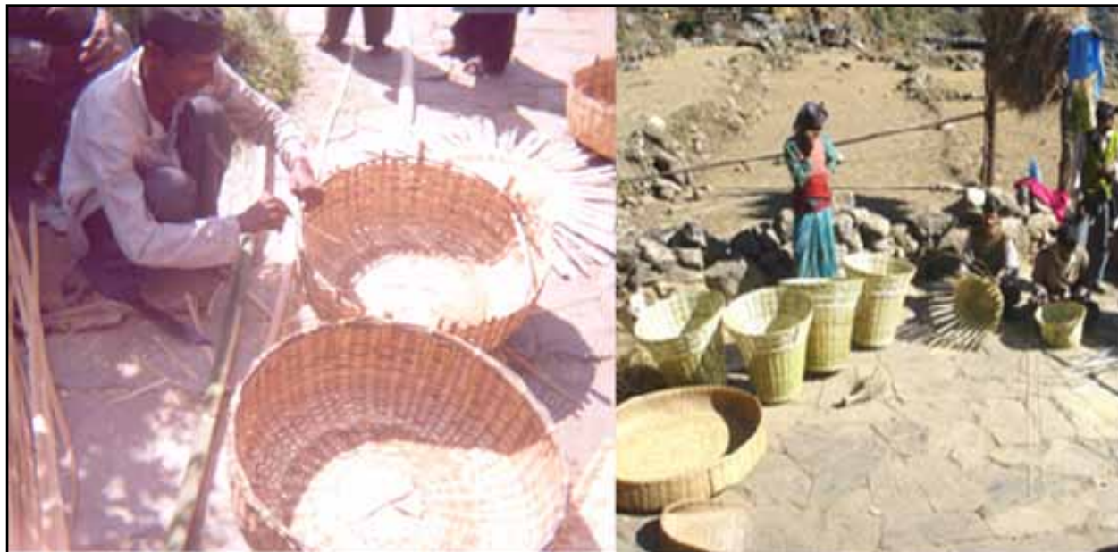
Figure 5. Traditional bamboo and ringal-bamboo items being made by artisans in Uttarakhand, India.