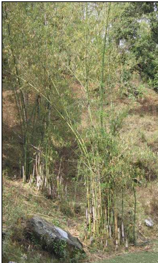
Figure 1. Bamboo plant, Uttarakhand, India.

Bamboo in the state is categorized into two groups; bamboo and ringal bamboo. Bamboo is a thick, long and slender like plant (Figure 1) while ringal is thin spineless plant (Figure 2). In Uttarakhand state, eight bamboo species belonging to five genera were recorded that grow natural-