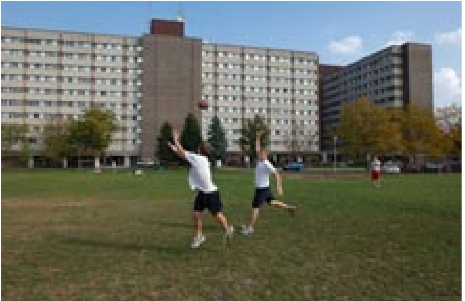
Figure Five: Towers Hall