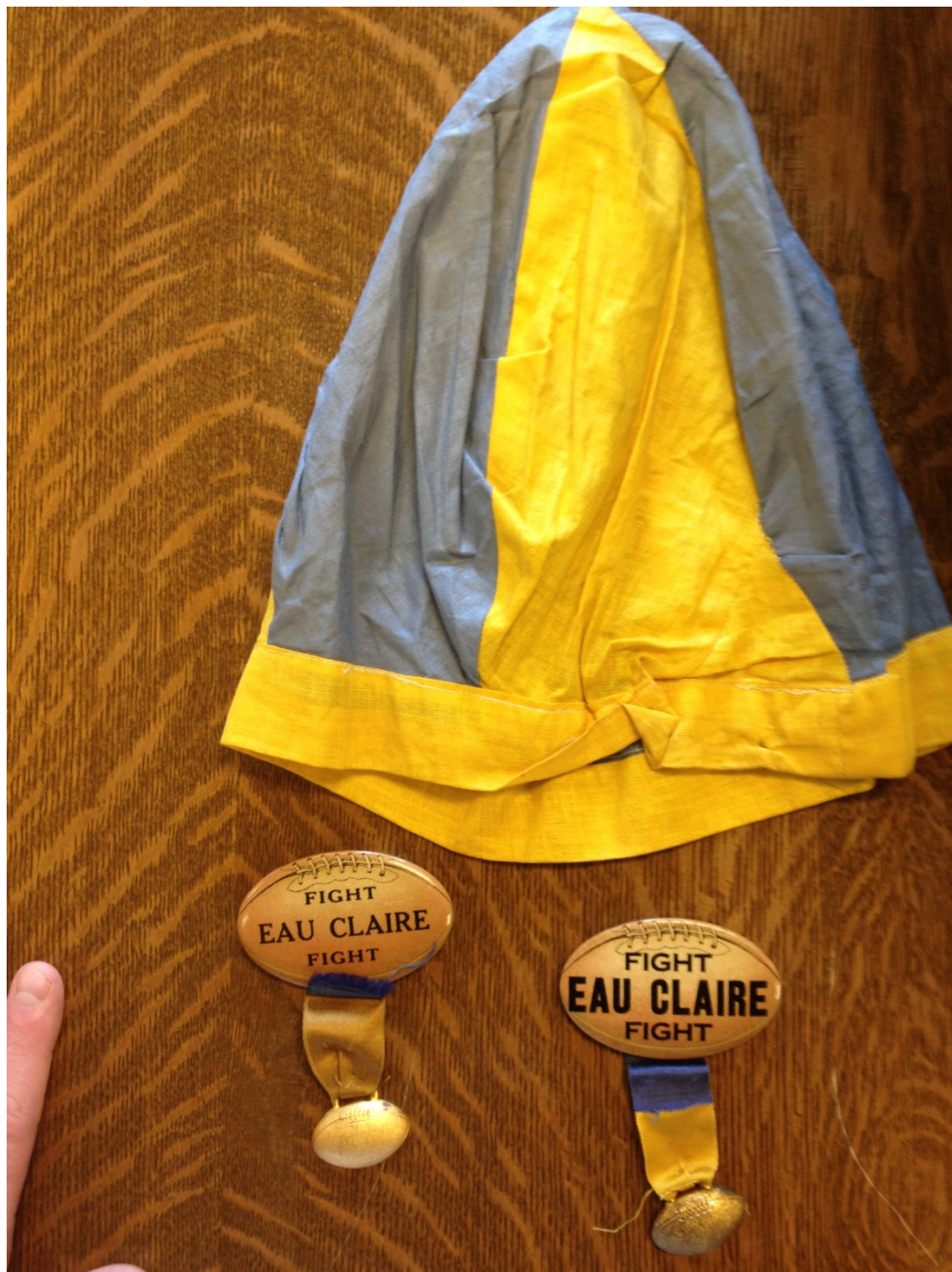
Figure Seven: Homecoming Hat and Pins