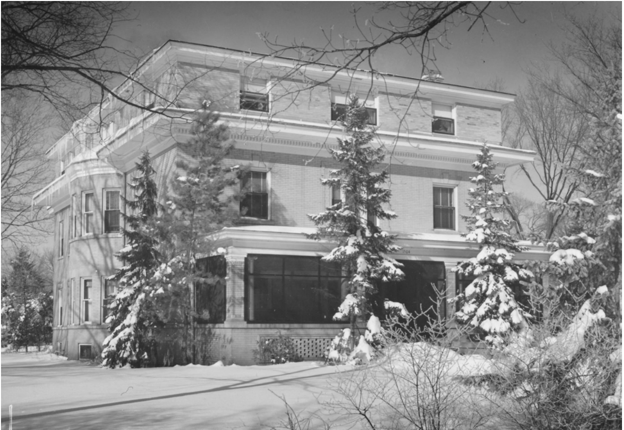
Figure Two: Memorial Hall

Source: Photograph Collection, AS 279, Box 6, Special Collections and Archives. McIntyre Library. University of Wisconsin Eau Claire. Eau Claire, Wisconsin.