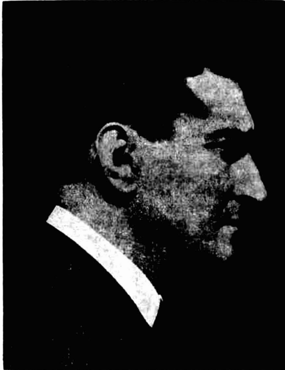
Dr. Antonio de Oliveira Salazar

many young Portuguese have spent at least part of their university years in Paris, where most of them were imbued with the tenets of the French leftists. This is another good reason why a large part of the Portuguese intelligentsia is not and never has been any too pleased with Dr. Salazar's Government.