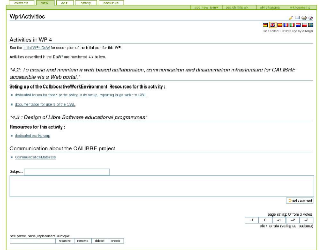
Fig. 7. CWE Wiki Support

The zWiki plug-in (figure 7) allows for the inclusion of wikis within the CWE. Internationalisation is very important to the CWE, allowing users of the CWE to find documents in their native language.