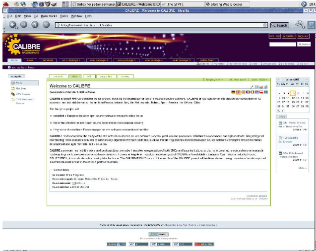
Fig. 4. The CWE Home Page

This section shows screen shots of the CWE itself and of specific functionalities that it offers.