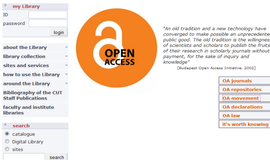
Fig. 1. Open Access website at the CUT Library home page