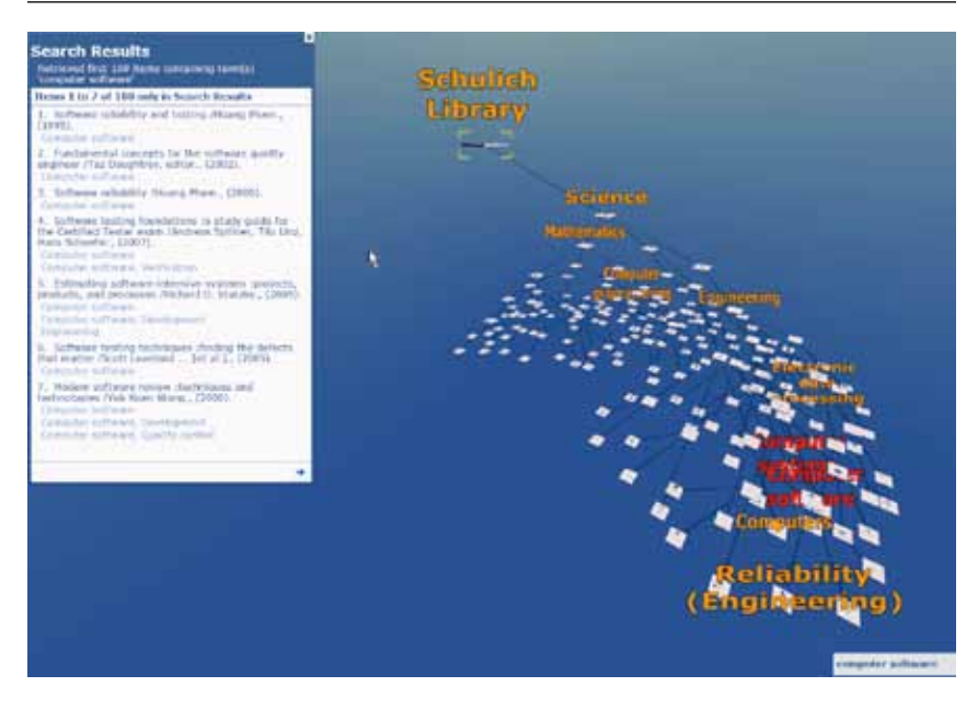
Figure 4. Integration of keyword searching which prunes the visible portions of the LCSH subject hierarchy.

Figure 3. Close up view of a subject map showing the immediate narrower terms belonging to an established string.