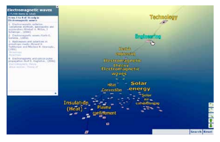
Figure 2. Visual browsing of the 3D LCSH tree of established strings with bibliographic record details (top left) and search box (bottom right).

established strings are indicated with a dark green border.