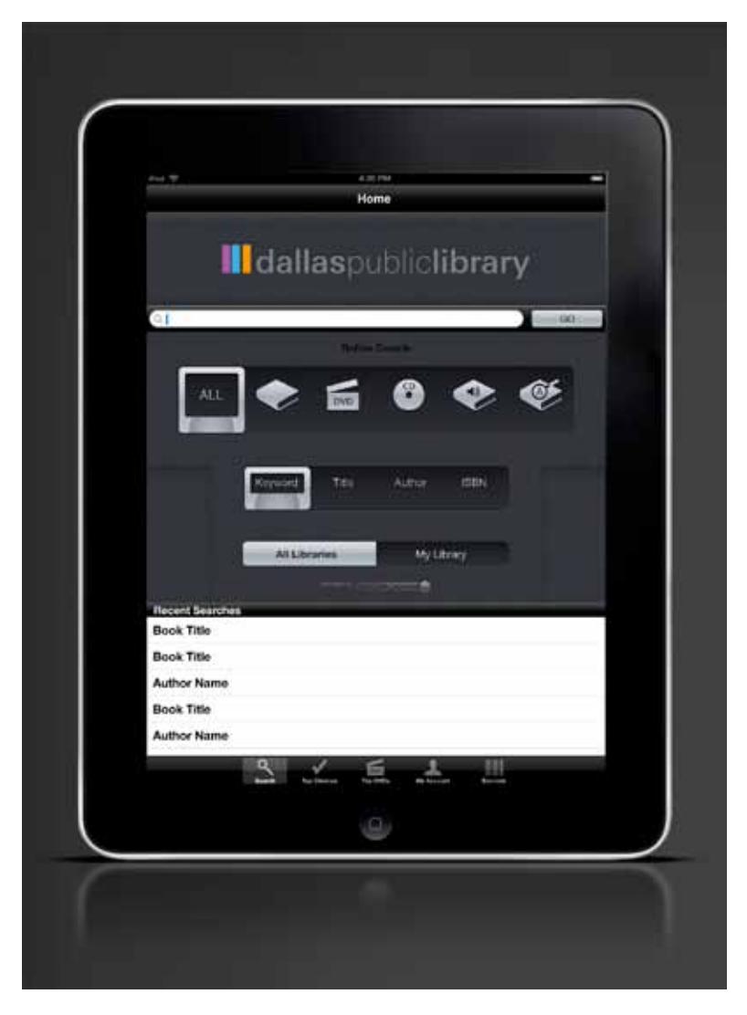
Figure 3. Screenshot of an iPad application. Intuitive, clear, and simple, a user interacts with this interface and its functions at a glance.