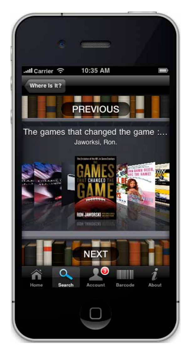
Figure 1. Browsing the stacks. Next-generation catalogues can mirror the feel of walking through the stacks virtually. This is an example of an iPhone application created for the Dallas Public Library by Hybrid Forge, which seeks to provide readers with a virtual experience.